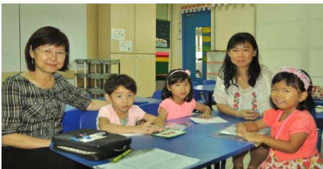
Kindergarten 1 Class