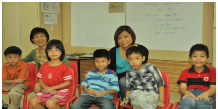
Kindergarten 2 Class