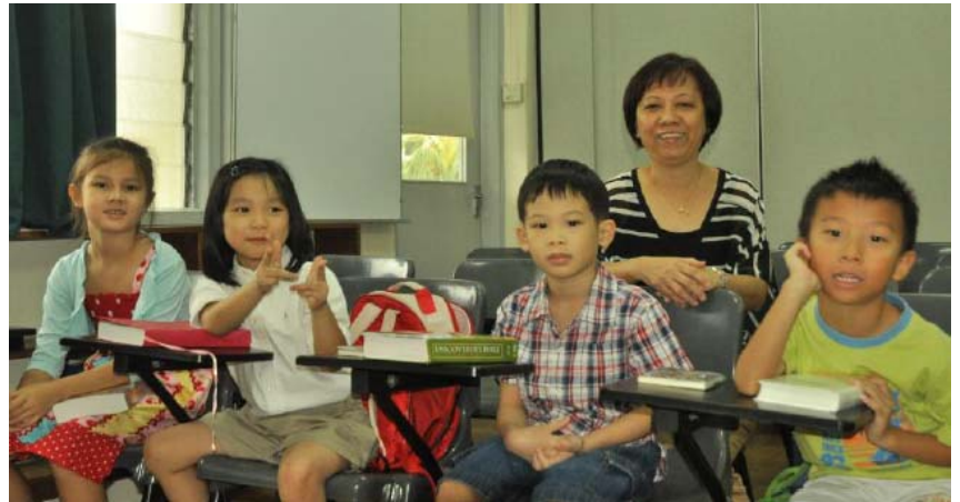
Primary 1 Class

Dear Lord, may I each day read Thy precious Word. May I love it and obey it too. May I grow to be like Thee. May my friends see Christ in me. In Jesus Name Amen.