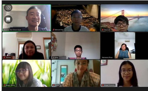
Sec 3 combined class