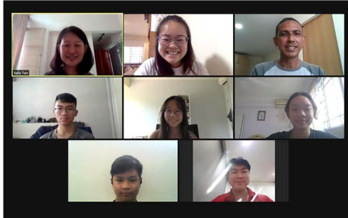
Sec 4 combined class