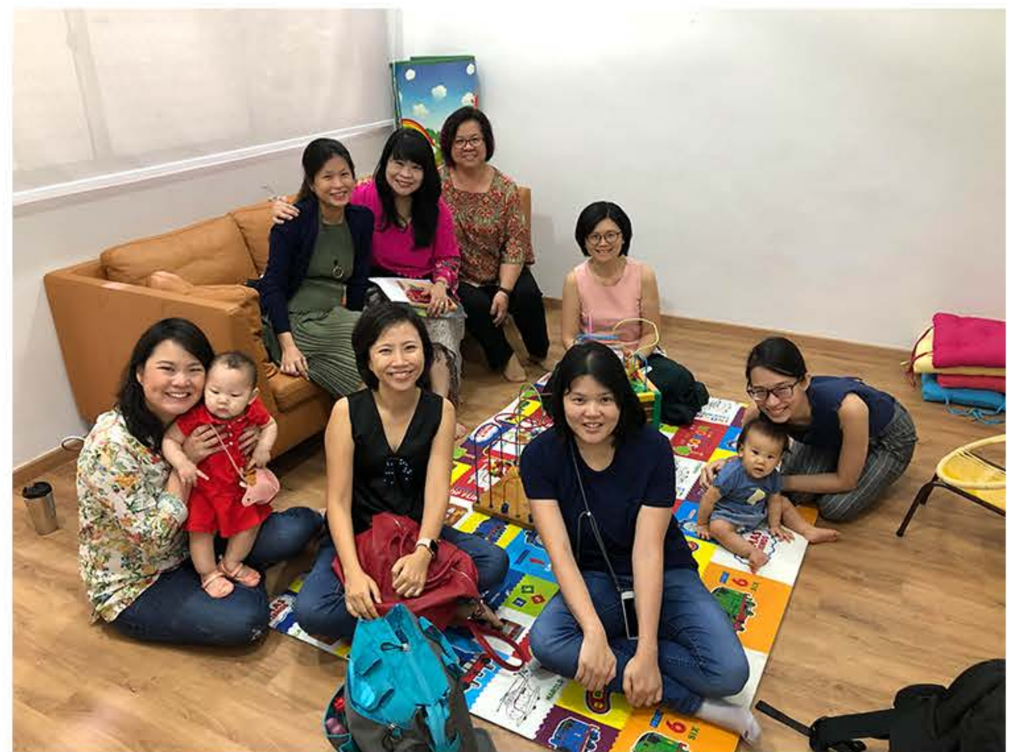
Adults #8 (Young Mothers)