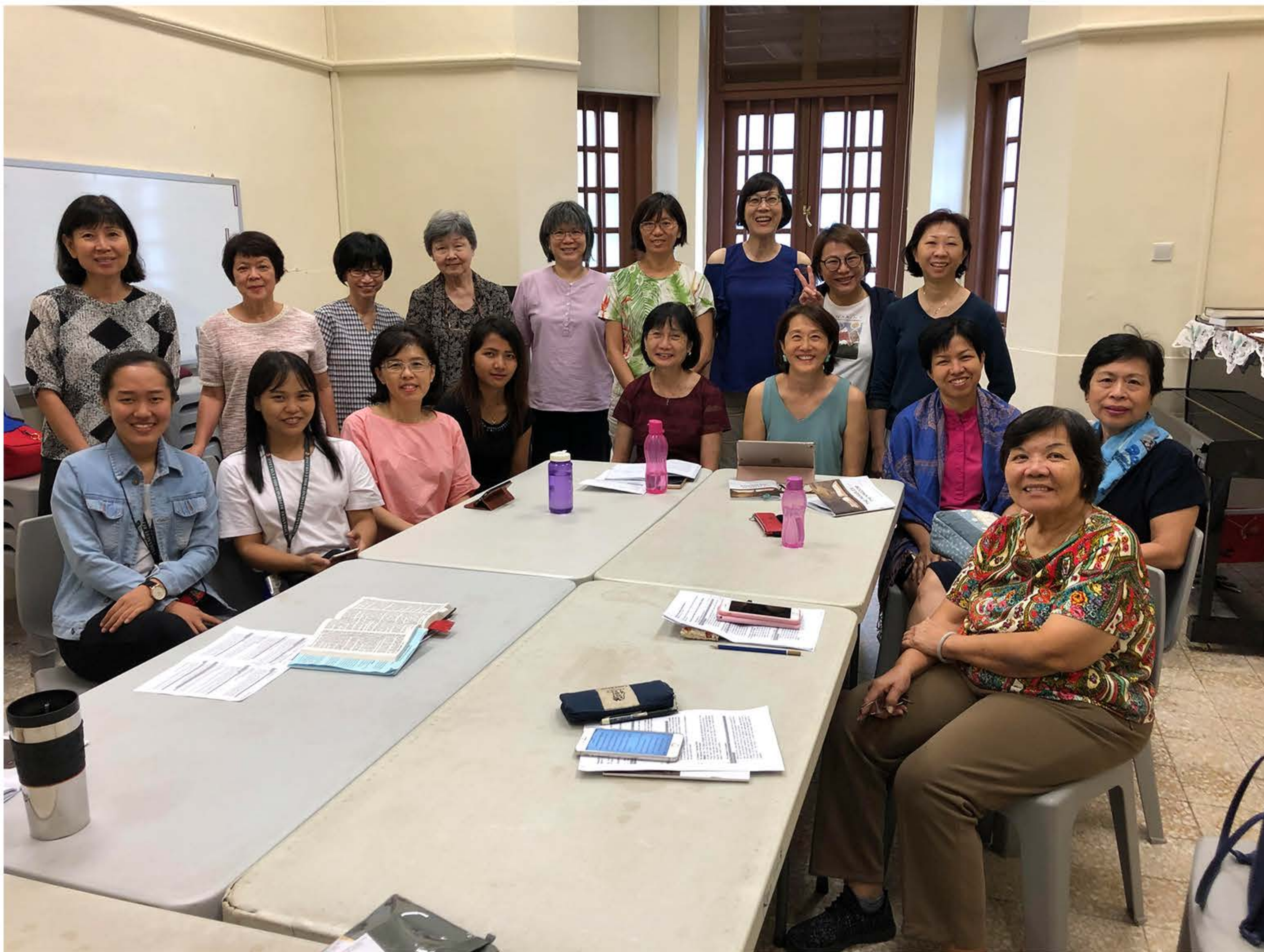
Adult #2 (Ladies)