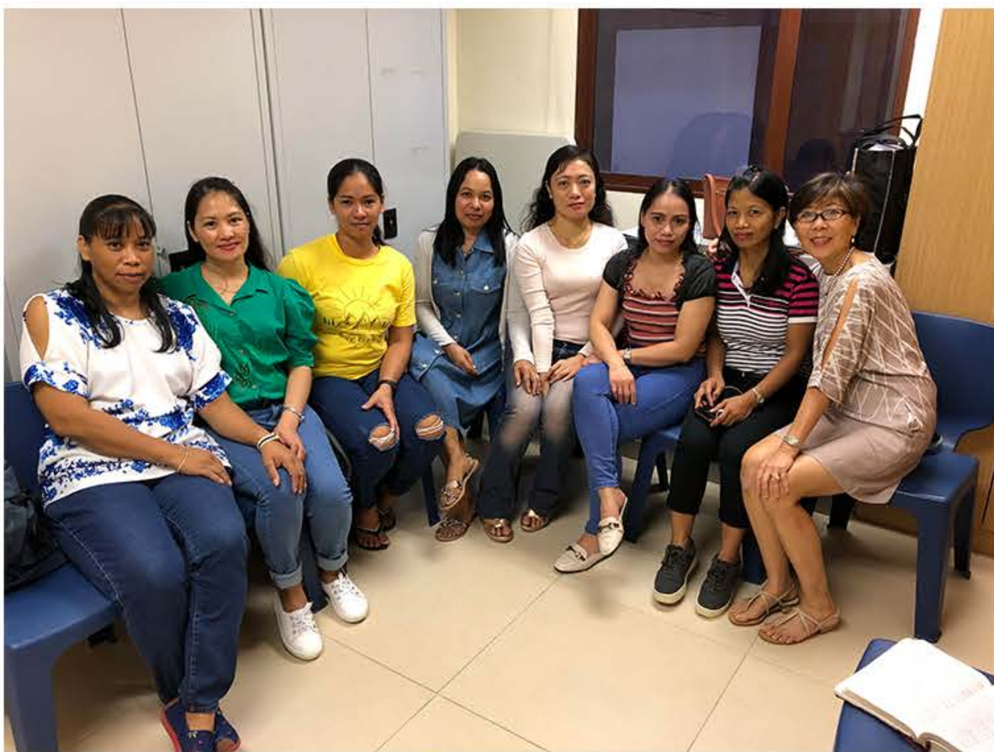
Adults #6 (Filipino Ladies)