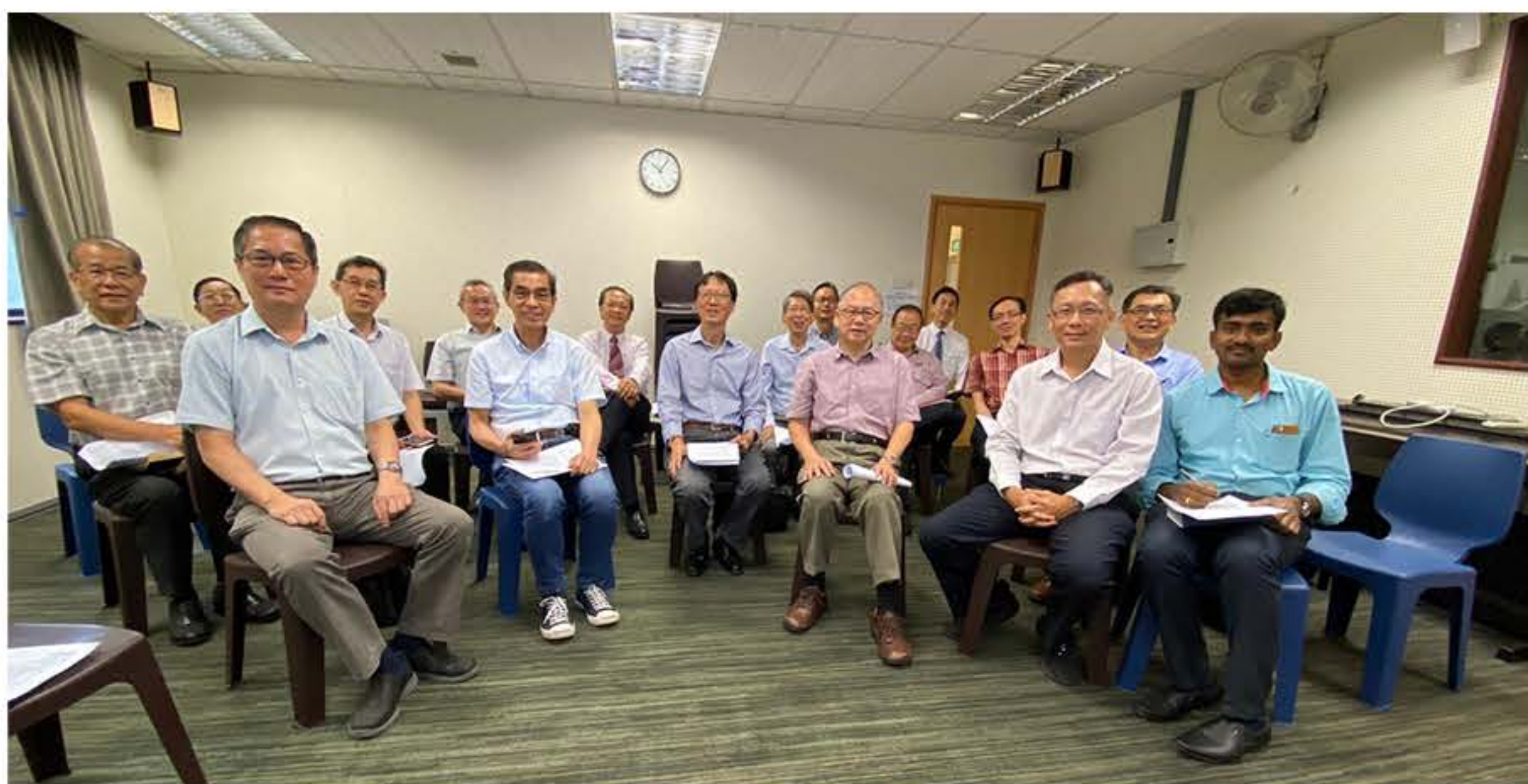
Adult #3 (Men)