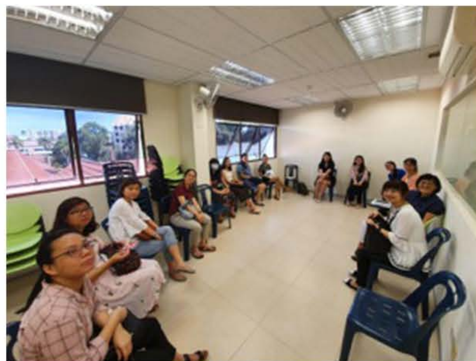
Adult #4 (Ladies)