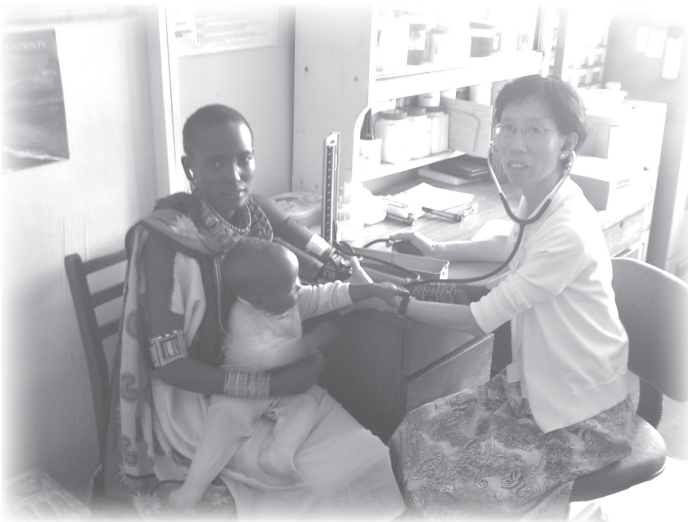
Sister Pui Meng meeting the medical need of a Maasai woman.

(Medical work to be handed to the locals)