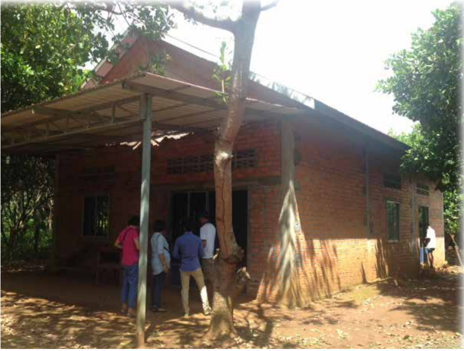
Sam Ker Village