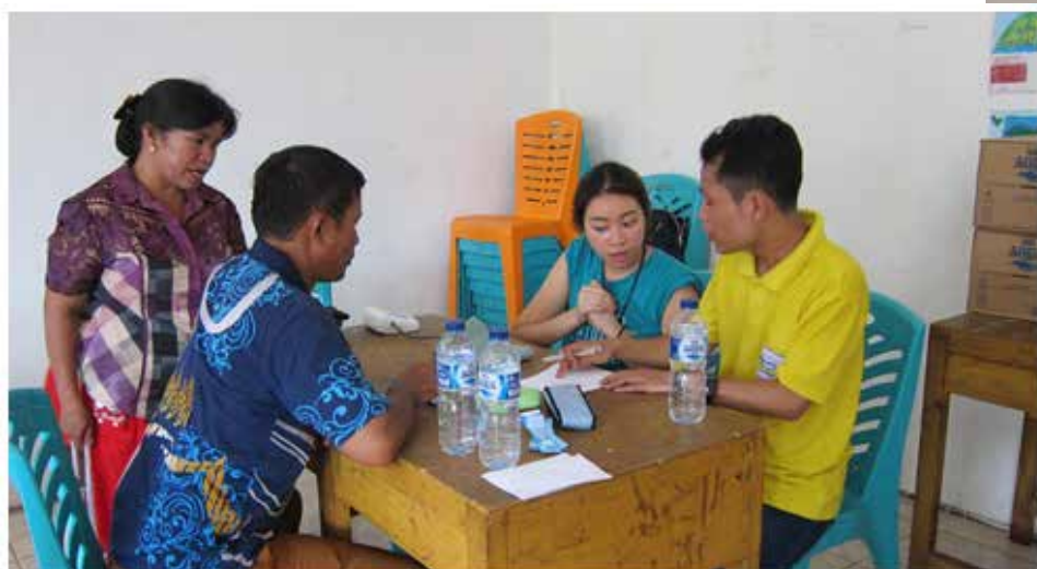
Medical and Dental Outreach at Libo Ceria School