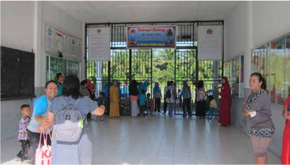
Penjuru Bangsa (Cornerstone) Primary School