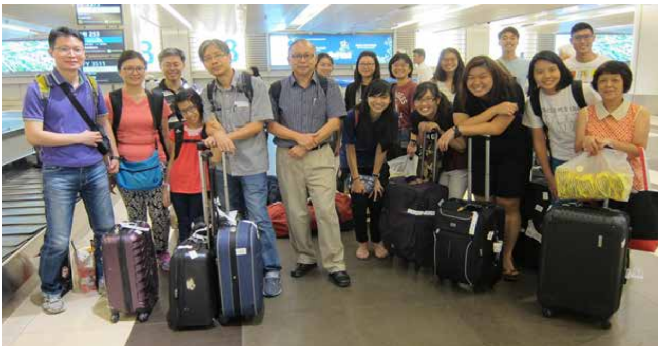
Home Sweet Home!