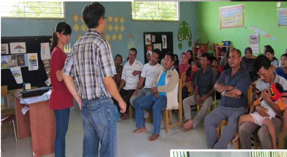
Adult Ministry/ Health Education