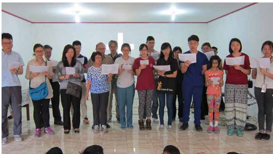
Song item by the team