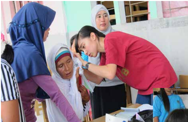
Registration and vitals taking