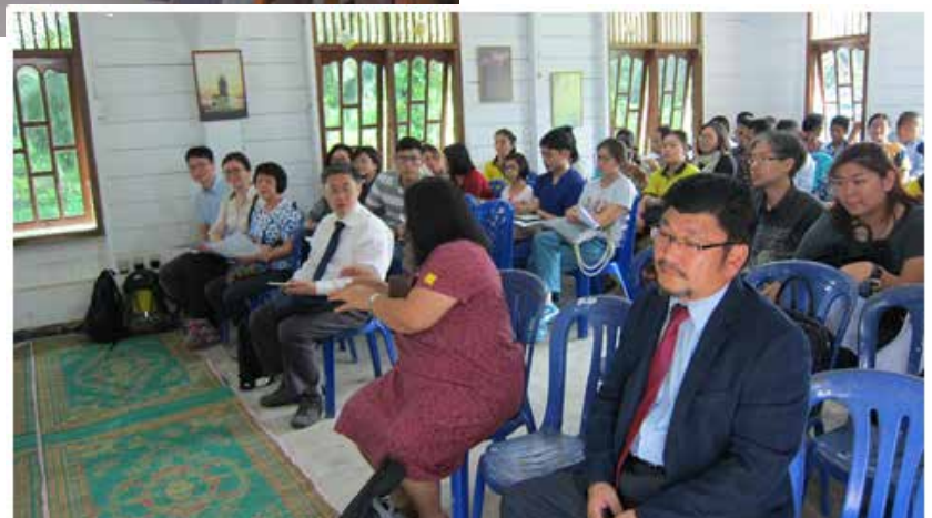
Worship Service at Libo B-P Church