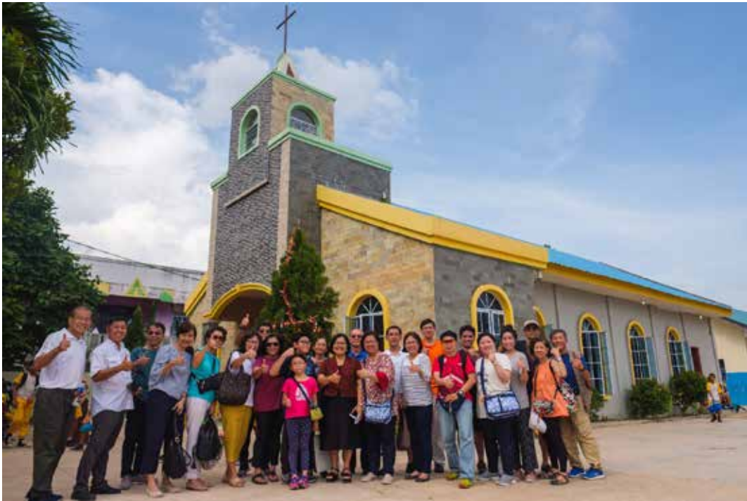
The combined Mission Team

The VBS Program conducted on Monday, December 10 was held in the premise of Tg Piayu School/Church.