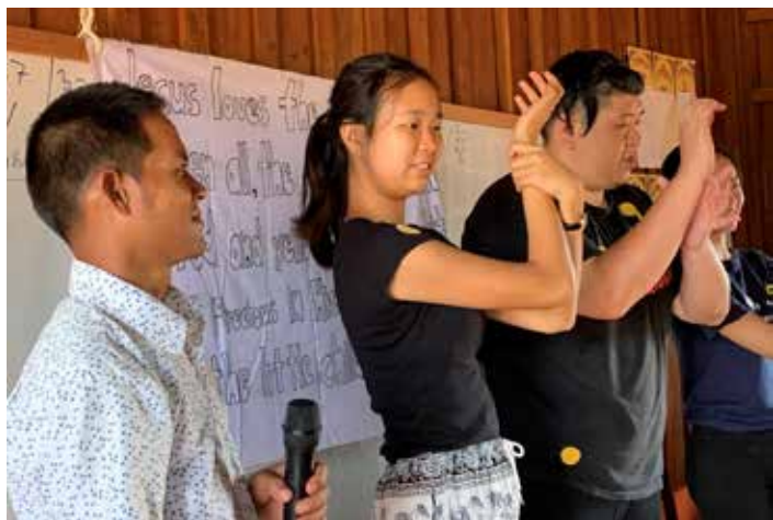
Teaching the children how to wash their hands. We also taught them how to brush their teeth.