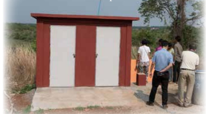
The toilets the church helped build.

The team ended their time in Banlung on 27th April and took the 7-hour drive back to Siem Reap. On the 28th April they departed for Singapore. The team praised and thank the LORD for helping them accomplish this mission trip. It was a great opportunity to serve the Lord in the mission field.