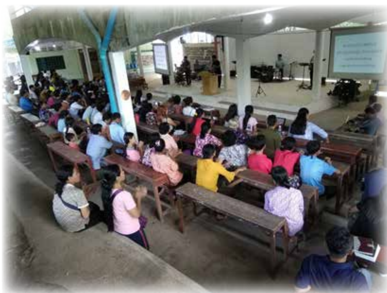
Bible School at KompongSom

KBS built 7 churches near Sihanoukville even though there was no resident pastor. KBS also sent bible students and graduates to Pailin in 2000, KohKong in 2002, StungTreng in 2003, as well as other provinces like Ratanakiri and Kratie. Many of them suffered in remote areas where there was no water supply, electricity, or any market nearby.