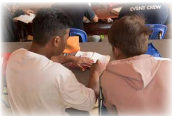
Receptive and participative students.

These were just some questions and the team with united hearts and understanding, answered them with reference to the Bible, and explained the meaning and context to them. Their unity was most obvious in their teachings.