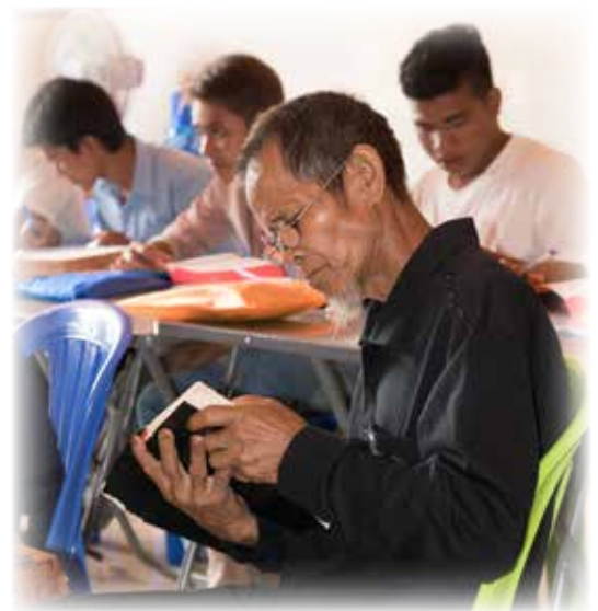
The patriarch, the first Christian in Le Village.