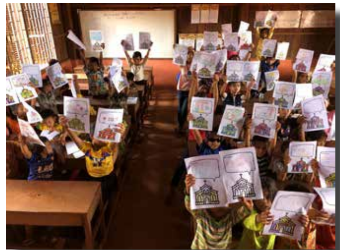
Children showing their craft for day 2. Many of the children asked for an additional colouring sheet for themselves.