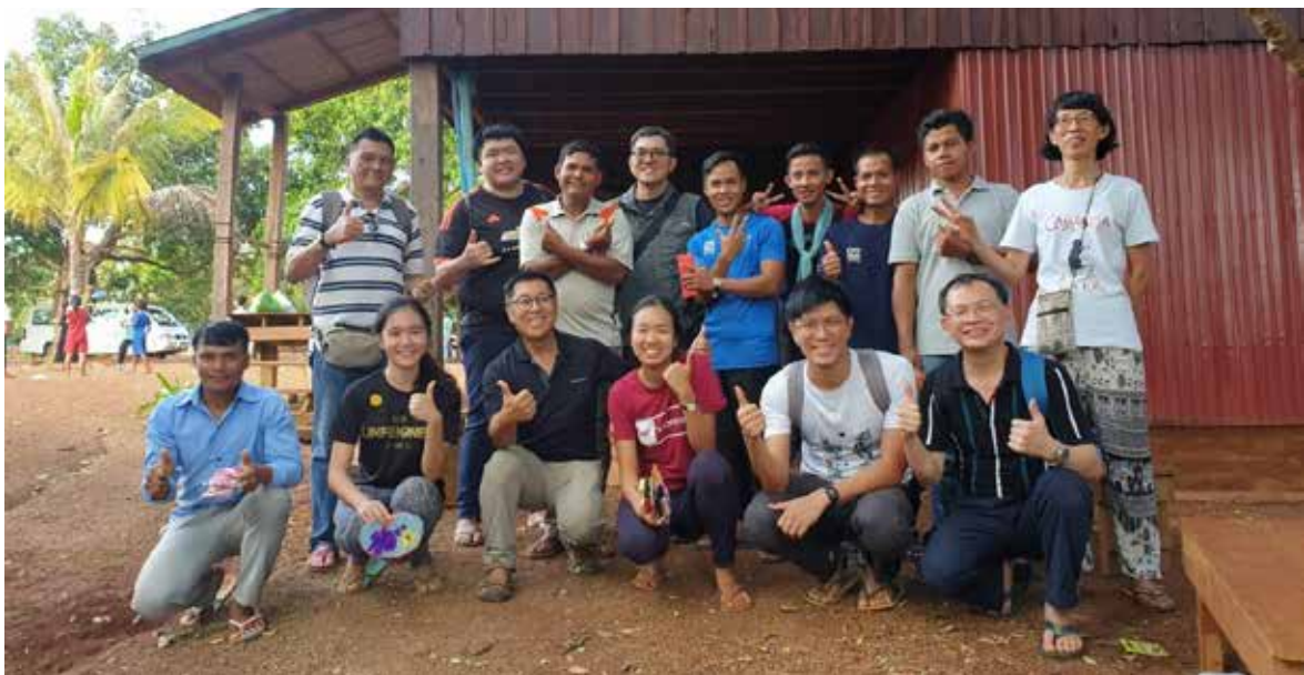
Mission team with the translators

These children were happy to see us, to play with us, sing with us, and learn from us. In return, we learnt from them. We learnt that Singapore’s busy materialistic narrative of happiness is a lie. Happiness does not come from having more or knowing more. True happiness comes from the Lord. True happiness comes from walking with Jesus.