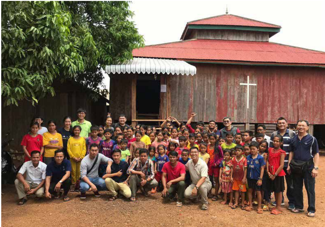
Group Photo of Children on Day 1.

We were very encouraged by the enthusiasm and receptiveness of the youths and the children during the two days of VBS. The children, after being taught songs and proper hygiene practices, readily applied them either by singing the songs wherever they went, or by immediately practicing them when they were washing their hands at the water point in the village. The youths were passionate and eager to learn from God's word. Many of them asked practical and thought-provoking questions.