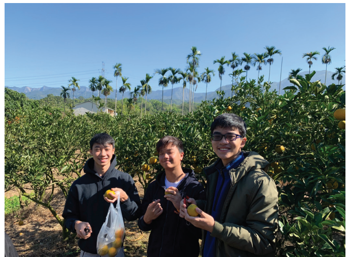
Figure 6: At a hearing impaired brother's farm