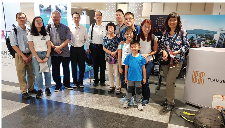
Group photo taken just after prayer at Harbour Front (Not in the photo: Anthony Quek)

We met at Harbour Front terminal at 7 am and prayed together at 7:40 am before going through the checkpoint. The ferry was full to capacity because of the school holidays.