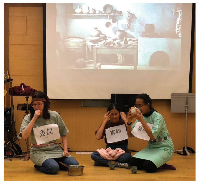
Figure 5: Dorcas Skit: Dorcas serving the widows at her house even though she was sick.