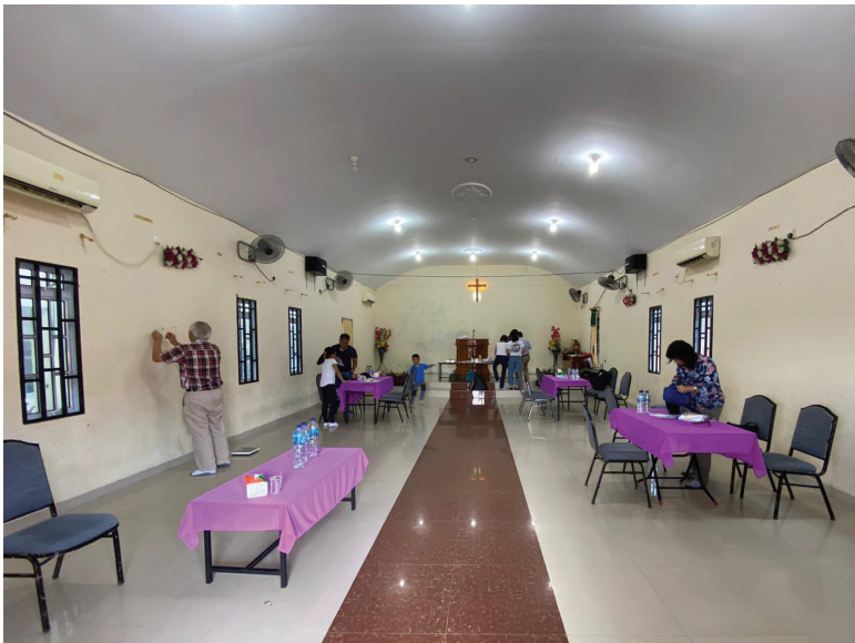
Setting up the medical clinic