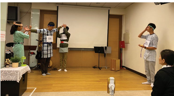
Figure 3: Judas Skit, Judas (right side) realising that he had betrayed the Son of God.