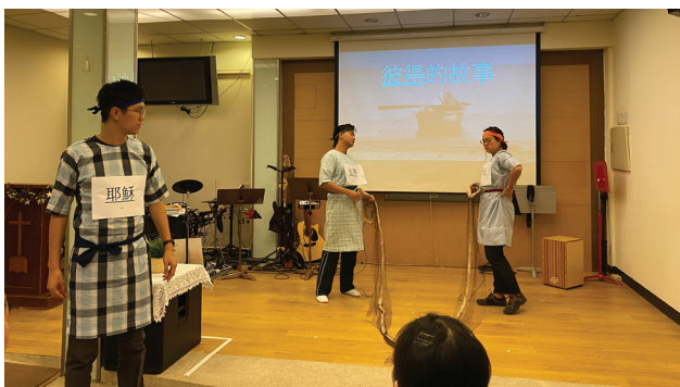
Figure 2: Peter's Skit: Jesus calls Peter