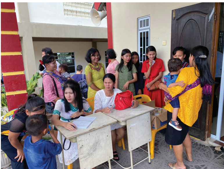
Patients registering for the clinic