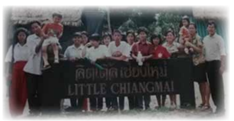
Youth Bible Club 1991