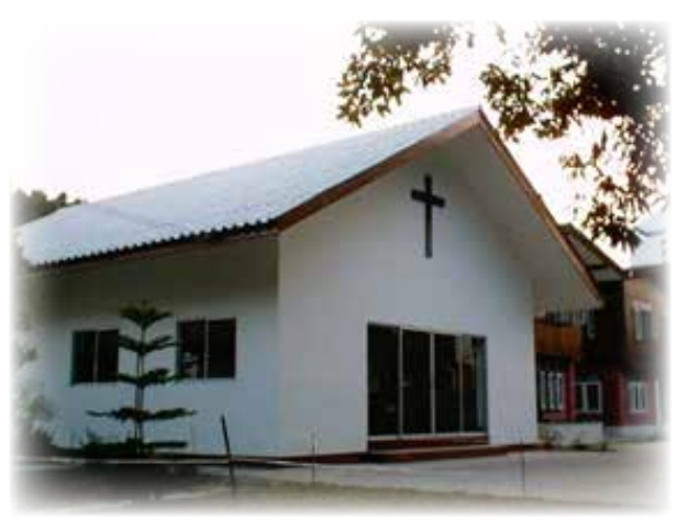
Eternal Life Church 2000