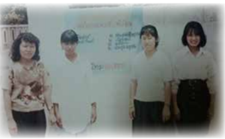
First fruits 1992 (Tha and Fon on right)