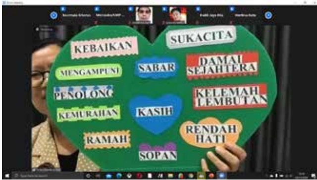
Teachers Webinar with 1000 Christian Religious Teachers from all over Indonesia.