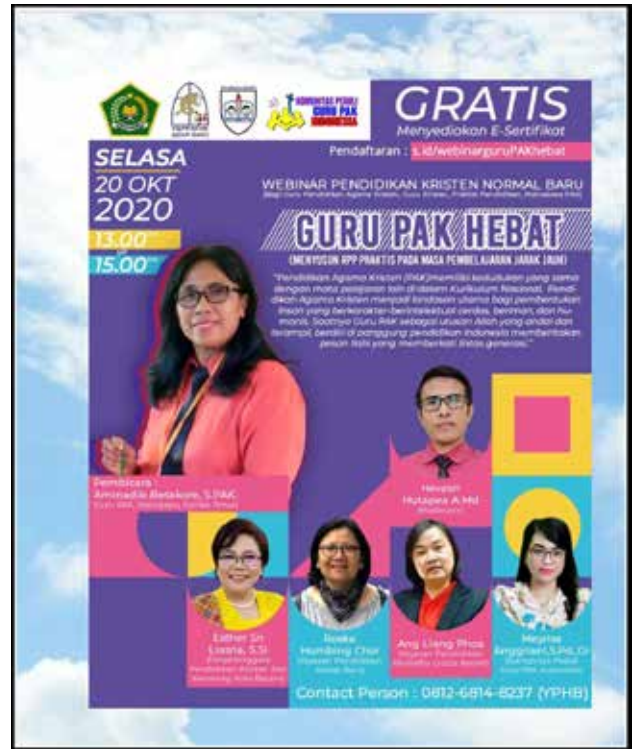
Teachers Webinter (International Webinar)