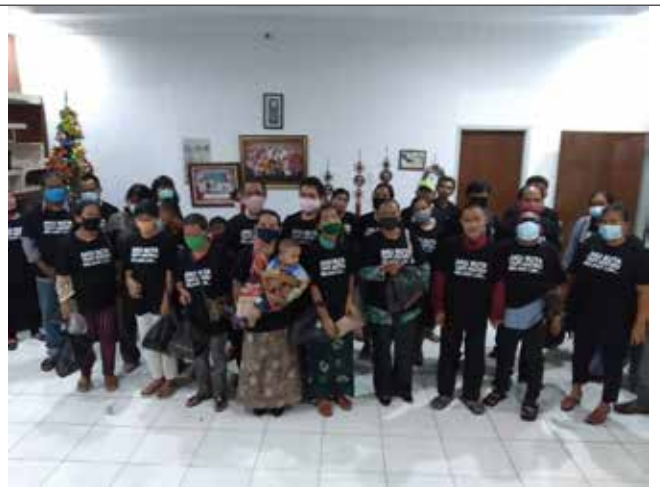
Virtual Christmas Celebration with brethren from The New Light Blind Church in Medan.