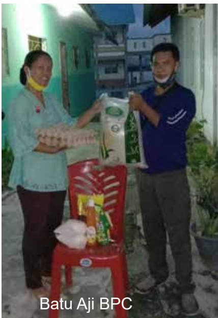
Batu Aji BPC