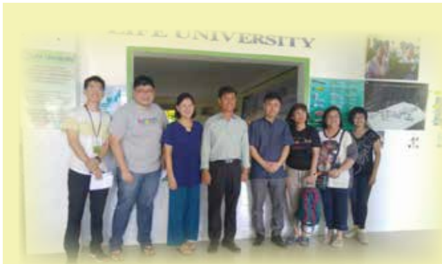
Lifers at Life University