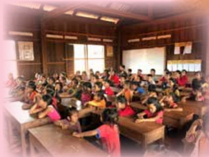
Children at Le Village, Ratanakiri