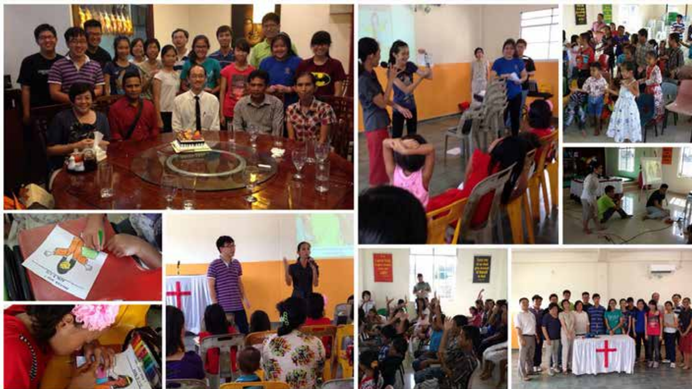
Batam Mission Trip – June 2014