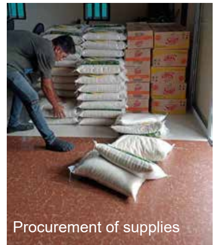
Procurement of supplies