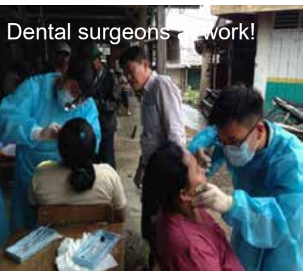
Dental surgeons work!