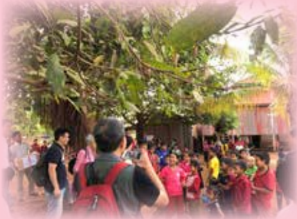
Lifers at Le Village, Ratanakiri

Missions Committee organizes mission trips, as well as medical and dental missions, to the various outreaches and encourages Lifers to participate and experience the sharing of the Gospel outside of Singapore. It is also an opportunity to fellowship and encourage our missionaries and the congregation.