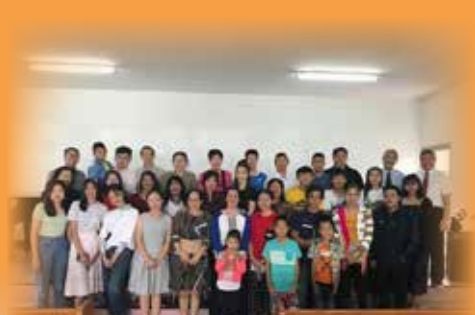
Chiangmai Mountain Church