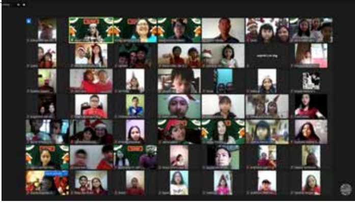
Virtual Christmas with 300 children and parents from the Sing Your English program.