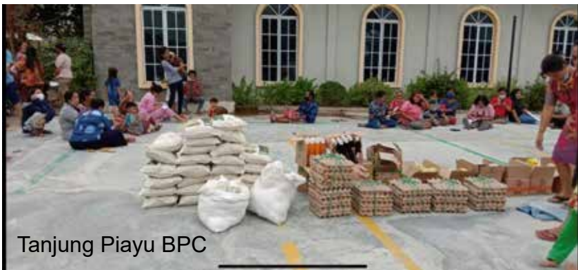
Tanjung Piayu BPC

“As we have therefore opportunity, let us do good unto all men, especially unto them who are of the household of faith.” Galatians 6:10