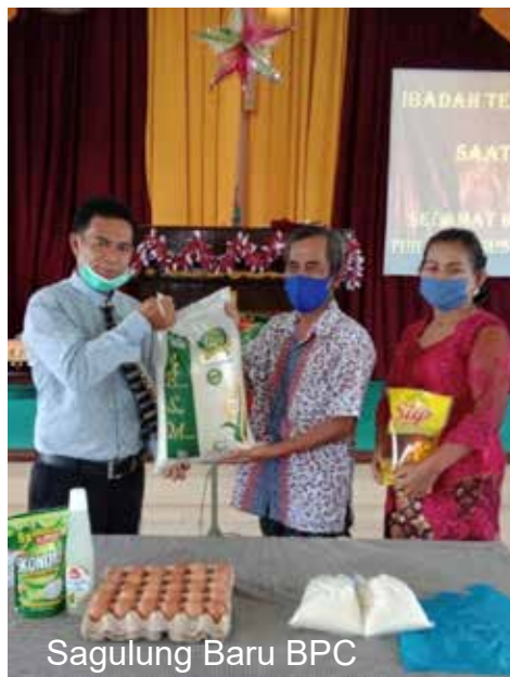
Sagulung Baru BPC