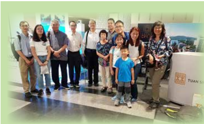
Medical & Dental Batam Mission Team