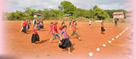
Children having games at school field