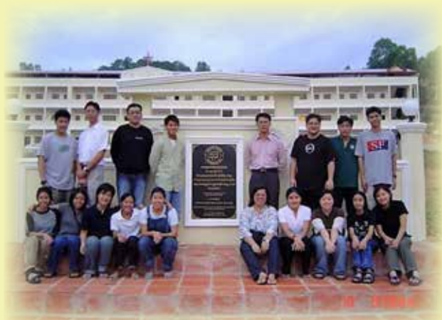
Young Lifers at Life University