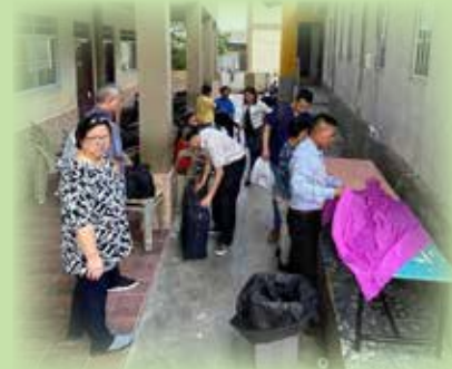
Setting up medical and dental clinics