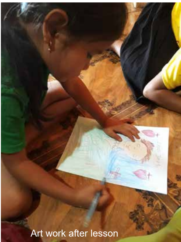
Art work after lesson