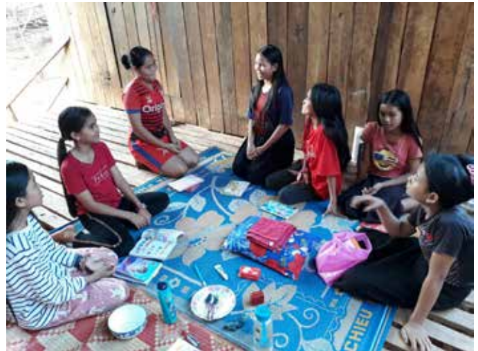
Conversation with one another is encouraged

Oftentimes, some of our Sunday School children are entrusted to take care of their neighbour’s little ones. They love them as their own siblings. The children watch over them with tender loving care - pacify them when they cry, feed them