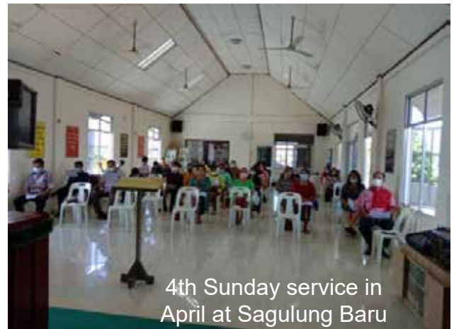
4th Sunday service in April at Sagulung Baru