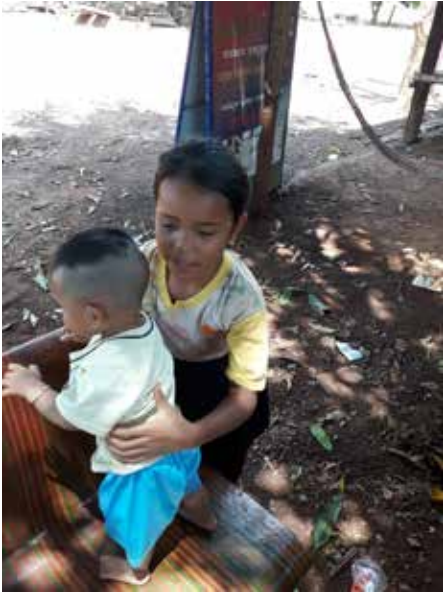
9 year old girl looking after 1 year old boy

when they are hungry, and play with them. They enjoy one another's company very much till their parents return. The eyes of the Lord are always guarding and protecting each one of them from harm and danger.