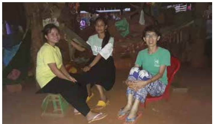
Visitation with the students