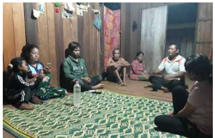
Visitation with the church leaders