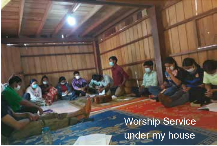
Worship Service under my house