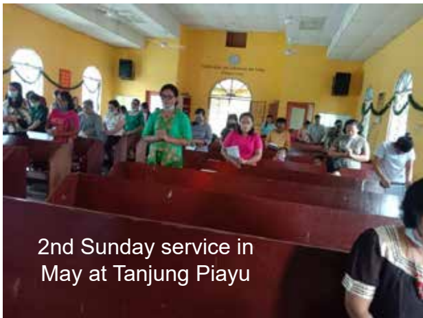
2nd Sunday service in May at Tanjung Piayu

We pray that the church members may continue to look to God for help (Psalm 121:2) and draw close to Him, our rock and fortress (Psalm 31:3) through the changing circumstances of life.