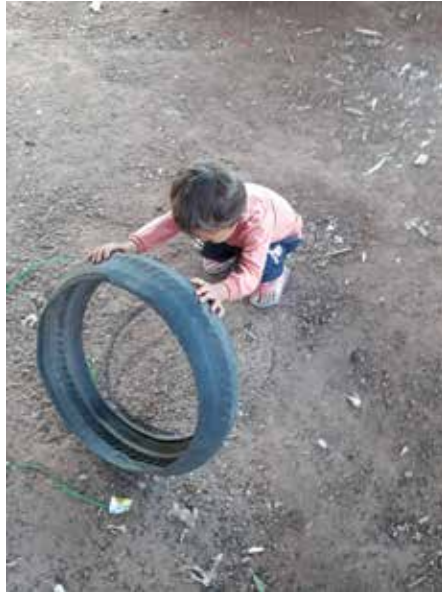
5 year old boy