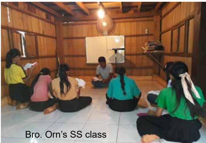
Bro. Orn's SS class