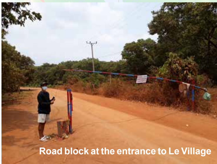
Road block at the entrance to Le Village

The Lord was good and gracious to Cambodia. From last February to February 2021, the number of Covid-19 cases was kept below 500 but in mid-March, Cambodia was hit with a sudden surge of Covid-19 cases in Phnom Penh. Rapidly within four months, the number of cases surged from 500 to more than 34,000 cases. All schools were closed.