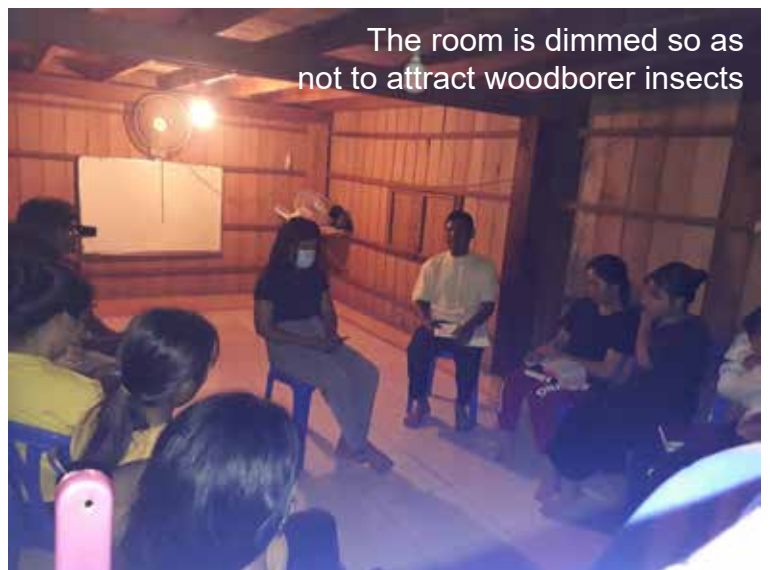
The room is dimmed so as not to attract woodborer insects