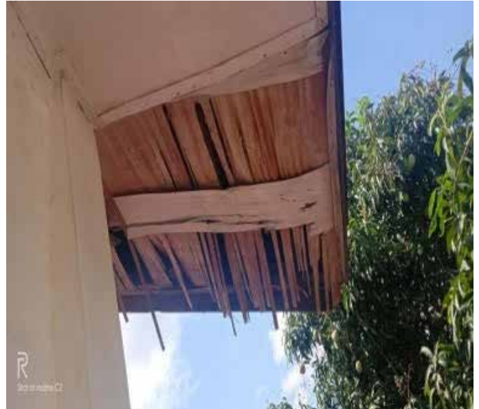
Current condition of Sagulung Baru church roof that is in need of repair