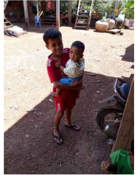
10 year old boy

There is no greater joy than to be used by our Master for His work though there are disappointments, pains and difficulties. I would like to echo a hymn to you as it speaks to me always: