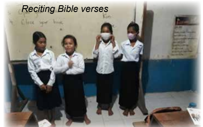
Reciting Bible verses