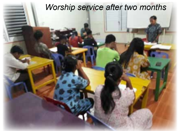
Worship service after two months