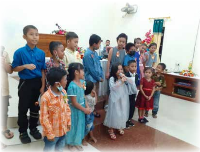
Remember the Bible verse