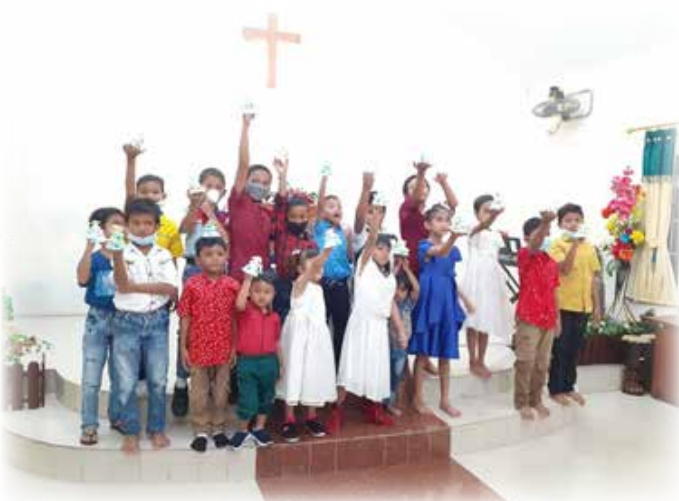
Sunday School creativity