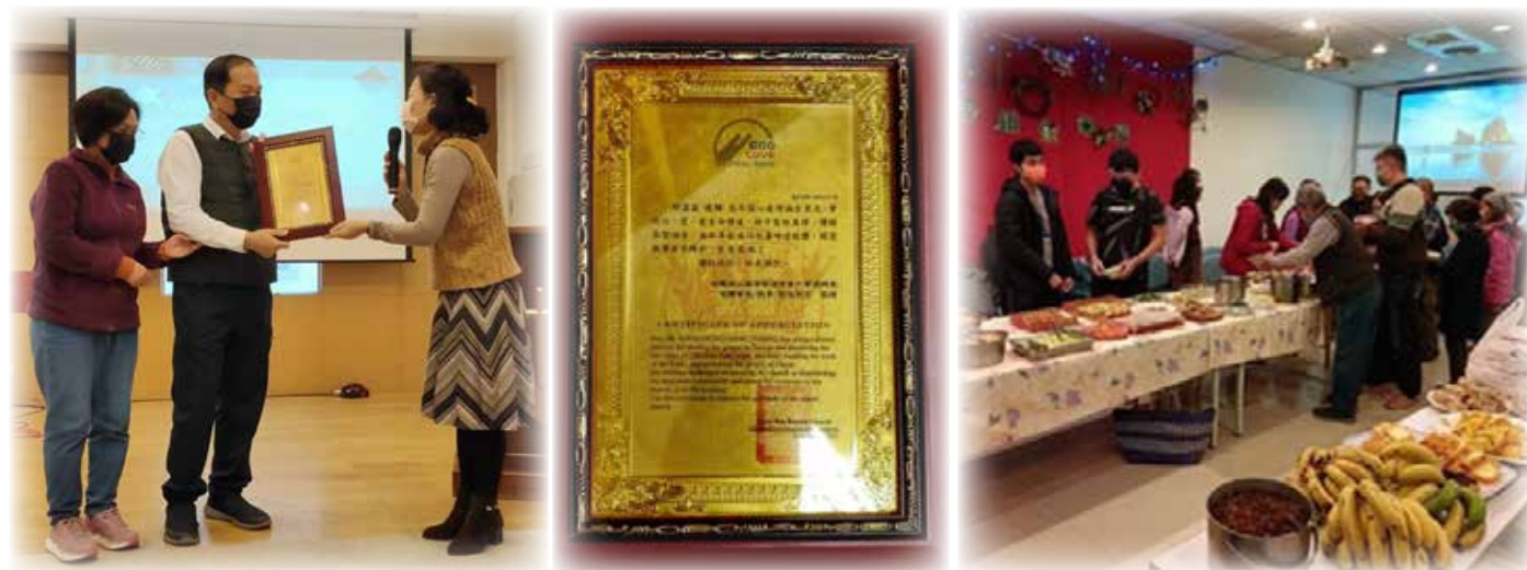
Liu Bao Church presented us a plaque during the farewell lunch (potluck)

During these three years' stay in Taiwan, we thank God for helping us to build good relationships with the brethren in Liu Bao Church. They organized a farewell lunch for us on 26 December 2021 and presented us with a plaque as a token of their appreciation for our work in the ministry. “So likewise ye, when ye shall have done all those things which are commanded you, say, We are unprofitable servants: we have done that which was our duty to do.” (Luke 17:10)