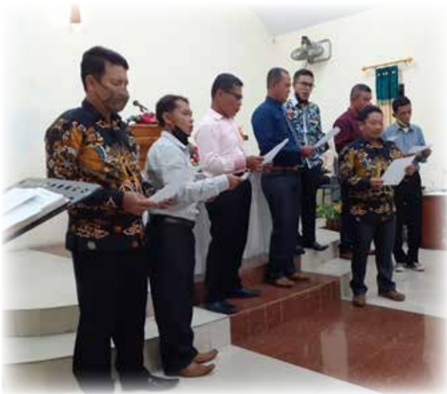
Praise item by fathers