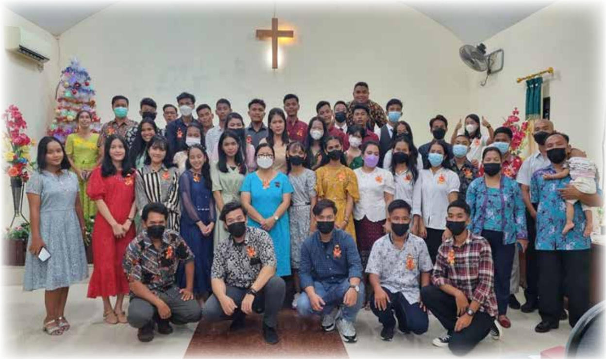
Combined Youth Christmas 2021

Another item that we are grateful for is that God still cares for His people and blesses us with good health, especially God keeps the COVID-19 virus away from the GAPPI Batu Aji congregation, so that we can conduct activities, work and participate in worship activities in the church. We are grateful for the Life BP Church Singapore which continues to support us in prayer and provide social assistance in 2021. May God continue to use His church to be the light and salt in the world. I am grateful for the ministry activities that went well in 2021. Other ministries such as the Household Fellowship, the Women's Fellowship, the Prayer meeting combined with the Youth Fellowship, Sunday School went well, except in August because of the government measures, namely PPKM (Enforcement of Restrictions on Community Activities). Thank God for the opportunity in 2021 to celebrate Easter, church anniversary, and Christmas. May God continue to use His church to serve God until the Lord Jesus comes the second time. Glory only be to God's name, Amen.