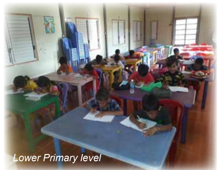
Lower Primary level

As the COVID-19 restriction measures gradually eased in September, we started the English classes for the Primary and Secondary students, and the Khmer language class for the Lower Primary students in the evening. Before the English lesson, we had a 30-minute sing-along session and memorization of Bible verses in the Khmer language. Introducing a Bible verse a week allowed us to share the gospel and teach them the Word of God. Pastor Sobin taught the Khmer language to younger children and the English language to the Secondary students and I taught the Lower and Upper Primary students.