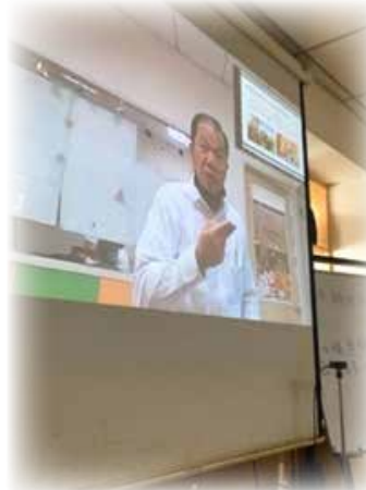
Trial run using ZOOM virtual platform, thank God everything went smoothly.