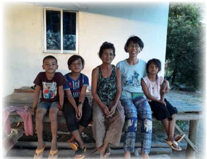
Saturday visitation with the children

We observed that many older teens, who attended the English class, did not come for the Sunday school despite our encouragement to do so. So in November, the Lord enabled us to start the Children's meeting on Friday evenings. Our goal was to reach out to those children who do not attend Sunday school. We had Christian movies, and Bible stories that conveyed the gospel clearly and then, followed by games. Thus far, the average attendance was around 15 to 20 students.