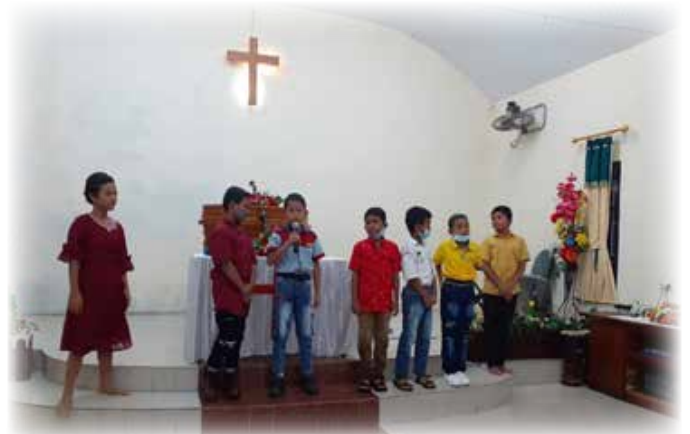
Let's memorise Bible verses