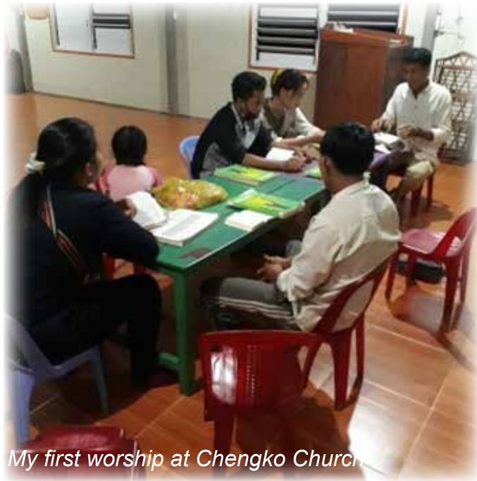
My first worship at Chengko Church