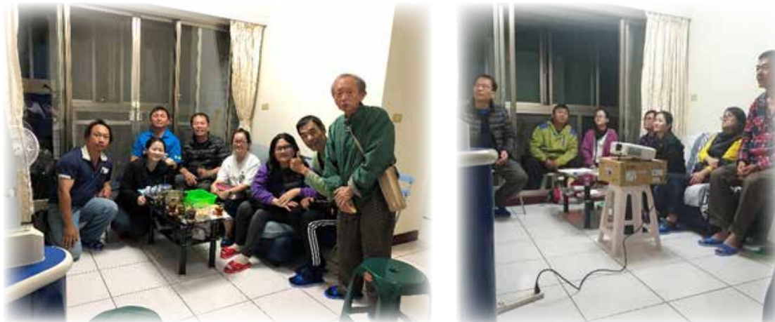
Evening Bible study at our apartment.

God has prepared everything for us to serve Him in Taichung among this group of deaf brethren. We managed to get our resident visa in July 2018. In addition, the Lord provided us with an apartment to stay in and touched the landlord to charge us with a very low rental cost. The place was in a good location and easily accessible for the deaf brethren to come to our house for evening Bible study after their work.