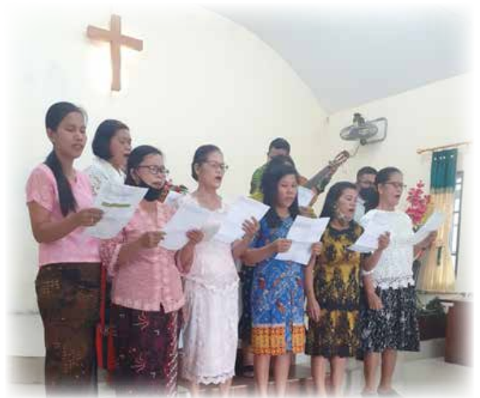
Teachers singing praise