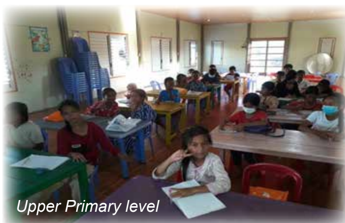
Upper Primary level