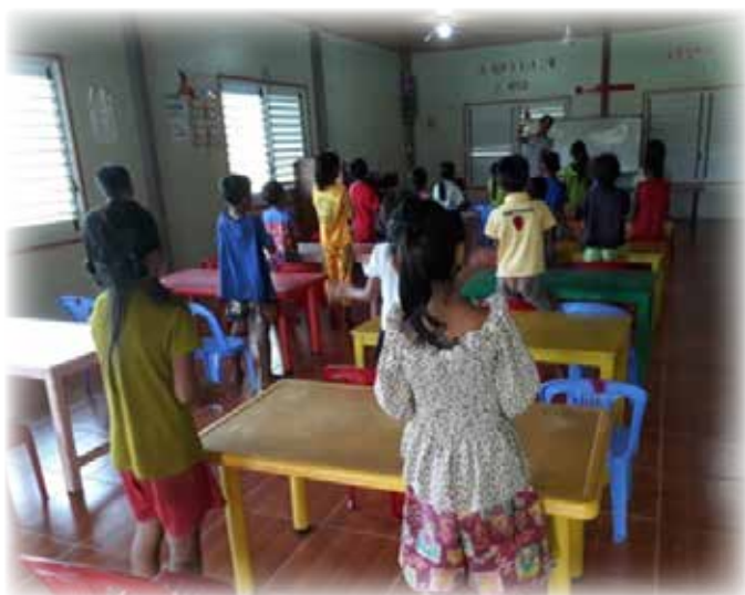
Friday Children's meeting