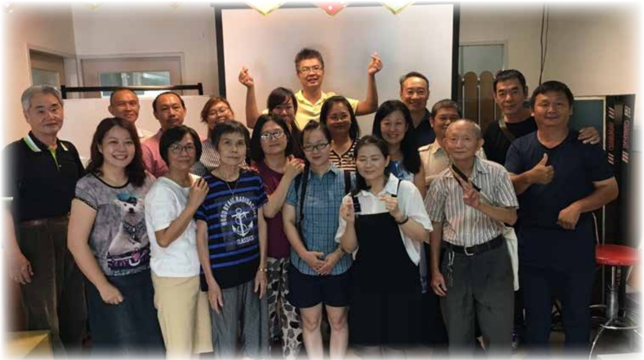
Our deaf brethren @ Liu Bao Church