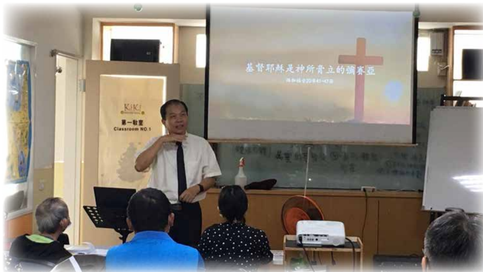
Teaching the word of God to the hearing-impaired brethren @Liu Bao Church.