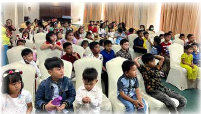
Children listening to the Christmas story