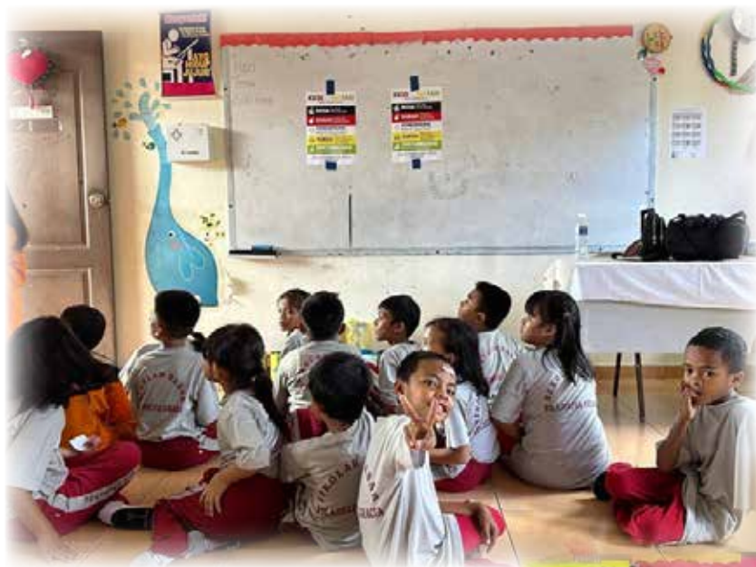
At the children's ministry station, with the gospel poster in the background