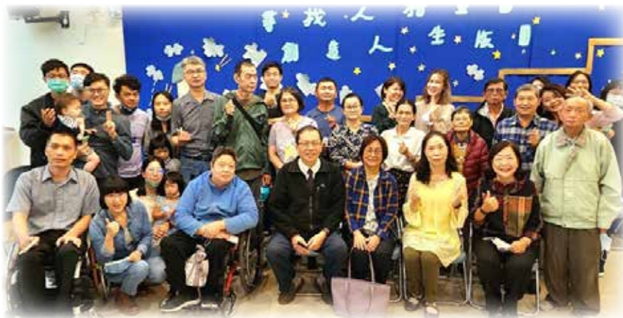
Members (including the hearing-impaired brethren) at Liu Bao Church.

We are grateful to the Lord that we were able to spend these precious 23 days with the brethren in Taiwan. It was a joy to see them growing in the Lord and serving Him. Thank God for helping us to fulfill our mission objectives during this trip.