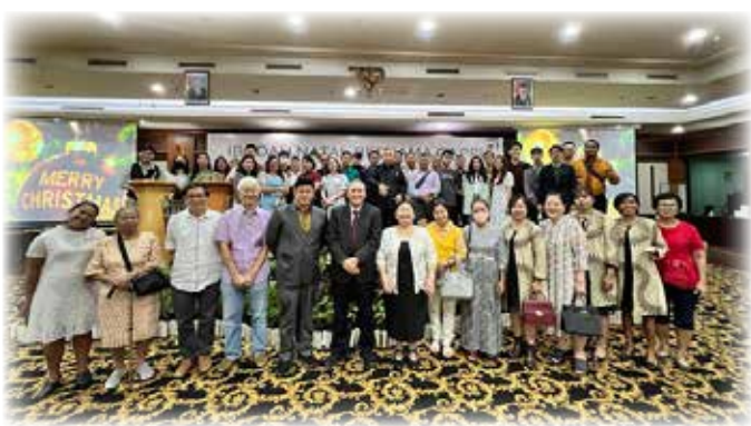
Filadelfia B-P Church Congregation