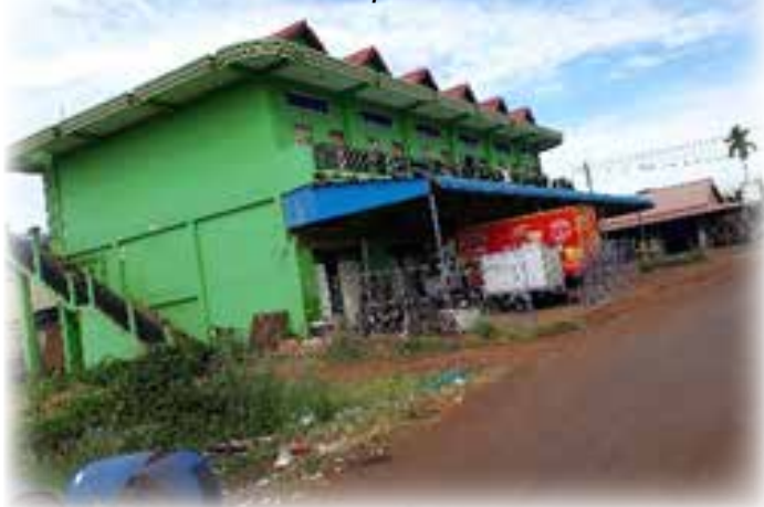
The current worship place – on the second level of one of the shop houses