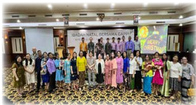
Sagulung Baru B-P Church Congregation