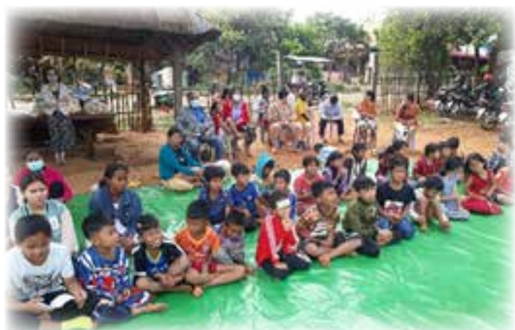
Children's parents sitting behind