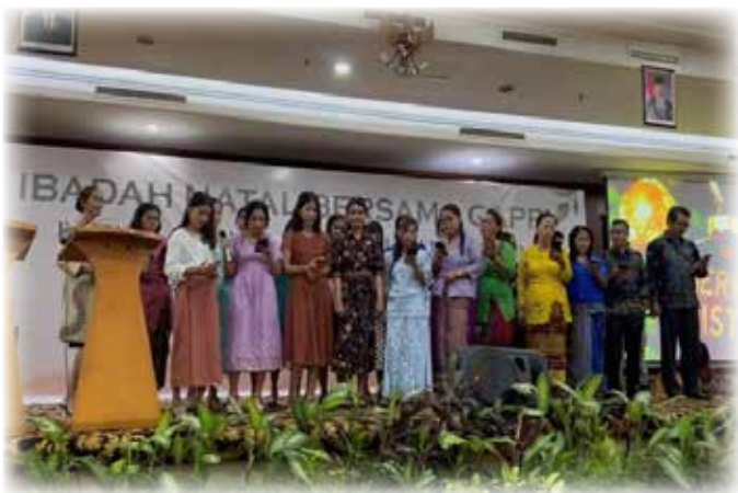
Batu Aji B-P Church Congregation