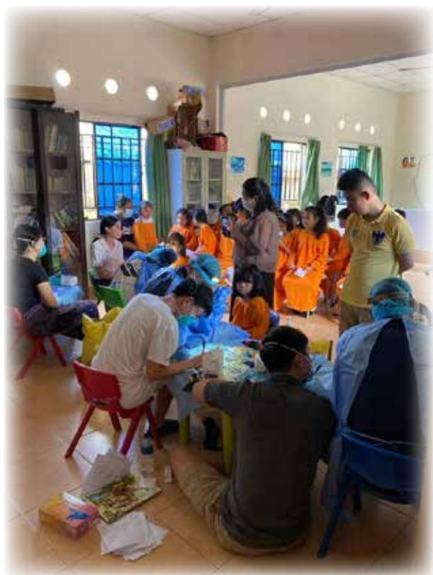
Dental team at the dental check-up station