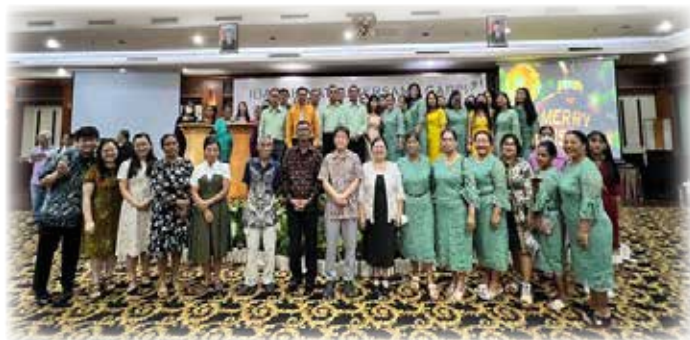
Tanjung Piayu B-P Church Congregation