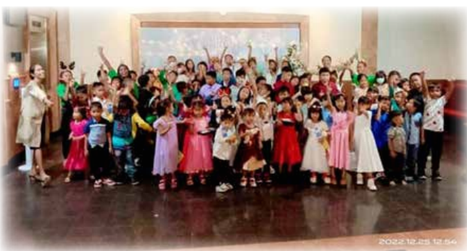
Children praising God