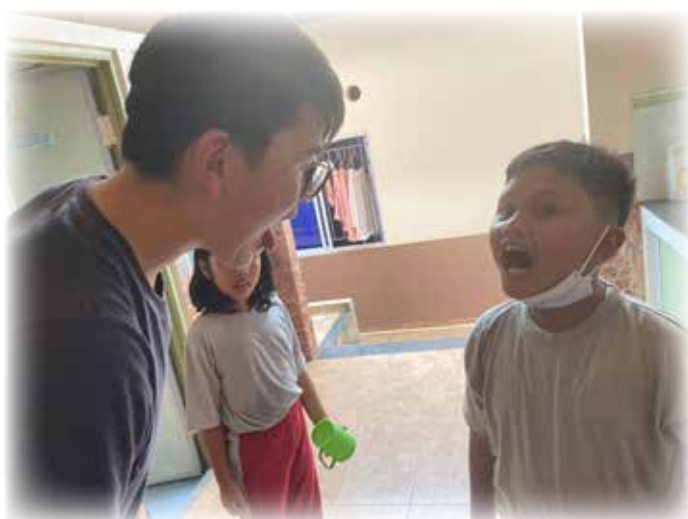
'Buka mulut', or 'open mouth', in Bahasa Indonesia