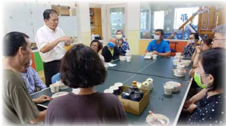
Giving thanks to the Lord for our lunch fellowship before our next session of Bible study.

In Taiwan, there are also many false teachers trying to infiltrate the churches with their false teachings, especially the prosperity gospel, tongue-speaking, miracles and healings, and other liberal theology. We must pray for God to preserve Liu Bao Church from falling into the devil's trap.