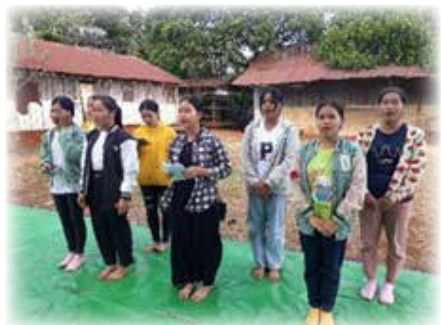
Le Village students' song presentation