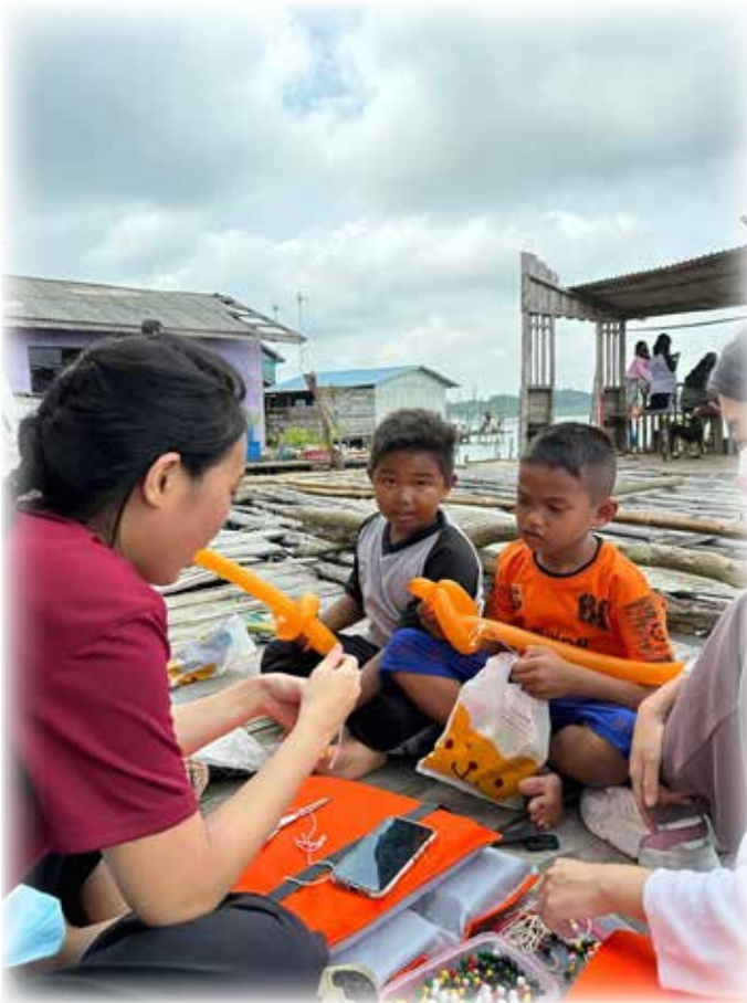
Making gospel bracelets with the kids at Pulau Semukit