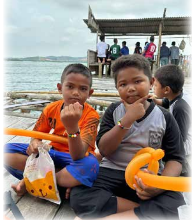
Posing with their gospel bracelets and balloon swords