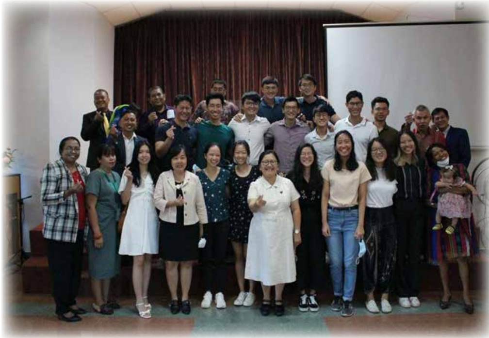
The mission team at Filadelfia B-P Church

“For my thoughts are not your thoughts, neither are your ways my ways, saith the LORD. For as the heavens are higher than the earth, so are my ways higher than your ways, and my thoughts than your thoughts.” Isaiah 55:8-9