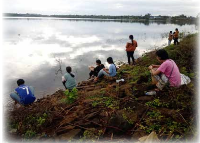
Visit to Kachanh Waterfall at Ban Lung (left) and went fishing (above).