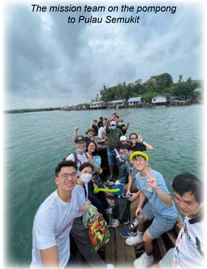
The mission team on the pompong to Pulau Semukit