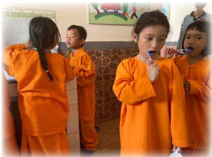
Children brushing their teeth before the dental checks

The team also had the privilege of seeing the Lord's faithfulness to both the school and the church. Despite the COVID-19 pandemic that threatened the economy and livelihoods of the locals, the school continued to flourish with sufficient intake of school children each year. One of the church deacons also painted an attractive sea-animals themed mural in the main assembly area of the school to liven up school compound. Furthermore, Elder Ady shared his latest school expansion project - to build another wing with a larger common toilet (Level 1) and chapel hall (Level 2) to meet the growing student population. It is our prayer that God can continue to supply all their needs and allow Filadelfia Grace school to grow in strength and size, by God's grace and in His good time.