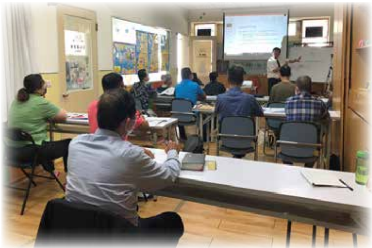
The hearing-impaired service.

It was truly amazing that almost thirty-four years later, the Lord has led us back to meet these hearing-impaired converts. In His own timing and special providence, the Lord called us back to Taiwan to minister to them. The Lord enabled us to obtain our resident visa, and we stayed three years in Taichung to build up the deaf ministry at Liu Bao Church. The Lord is good to us, and he answered our prayers by calling some brethren in Liu Bao Church to take over this special ministry.