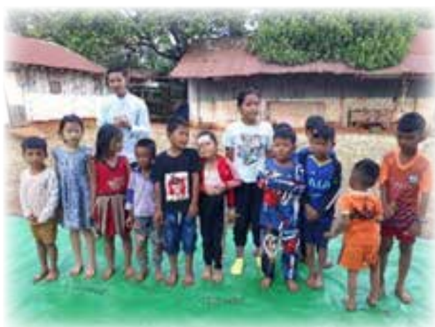
Sunday school children's song presentation