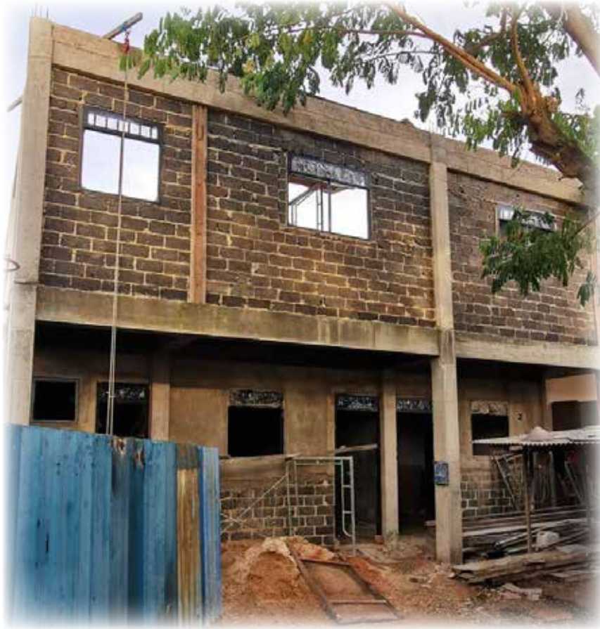
[Under construction] Additional block to accommodate the growing school population