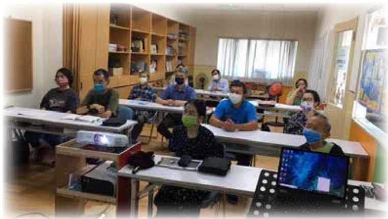
The hearing-impaired service.