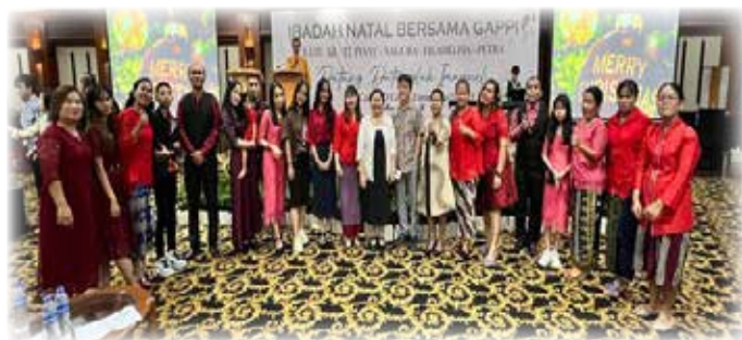
Petra B-P Church Congregation