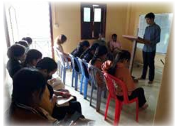
Worship Service – with the Le Village students