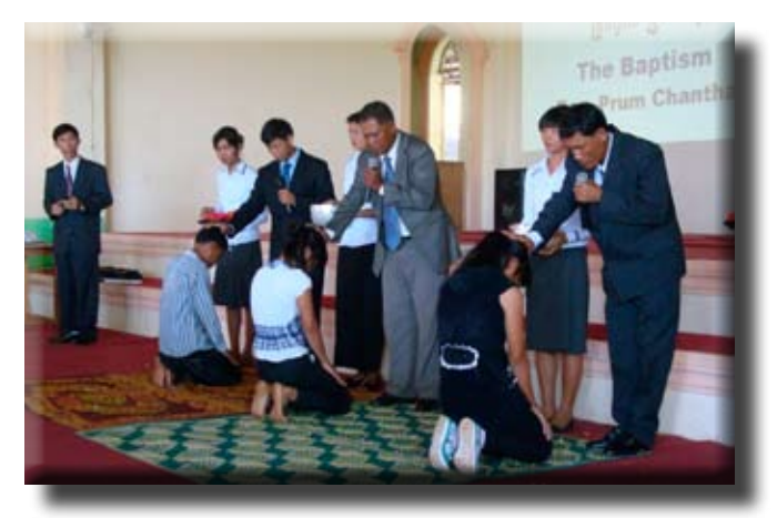
Baptisms by the three pastors