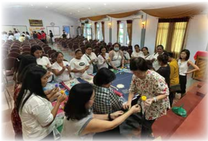
Sis Bernie and team demonstrating how to make a hand bouquet

Saya terberkati dengan acara komisi gabungan kemarin, selain terberkati dengan firman Tuhan yang disampaikan, saya juga mendapat ilmu cara belajar merangkai bunga, bertemu dgn teman2 baru dan mendapatkan sukacita yg luar biasa, semoga akan ada lagi acara2 seperti ini untuk selanjutnya.