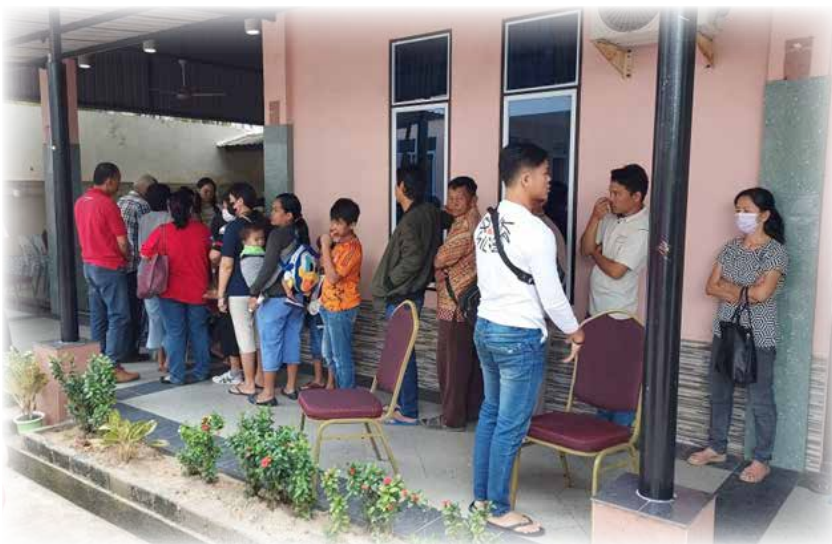
Long registration queue to see the doctors and dentists