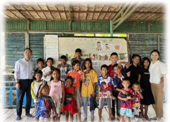
Sunday School Students