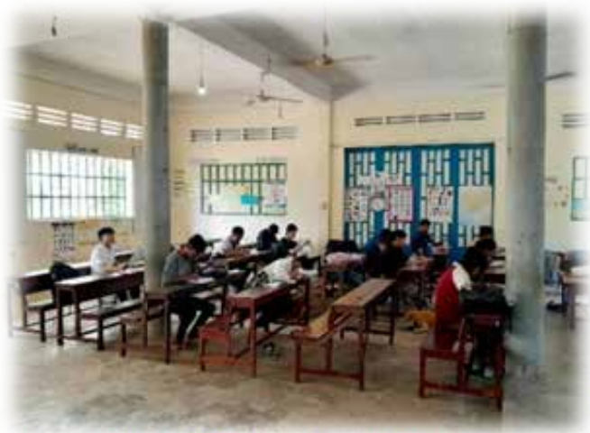
Komongsom Bible School

Except for 2022, the number of applicants for KBS had been low for five years. Those who graduated from KBS and became KCS teachers said that the enthusiasm of new students was quite different from before. Except for the morning classes, which KBS students were required to attend, student participation in my afternoon Korean class and evening Chinese class has been declining. Nevertheless, to raise up God's workers who will lead the next generation, KBS teachers encouraged them to continue teaching with patience. In such a situation where there are few labourers of the Lord to harvest in the mission field, raising them remains a difficult task.