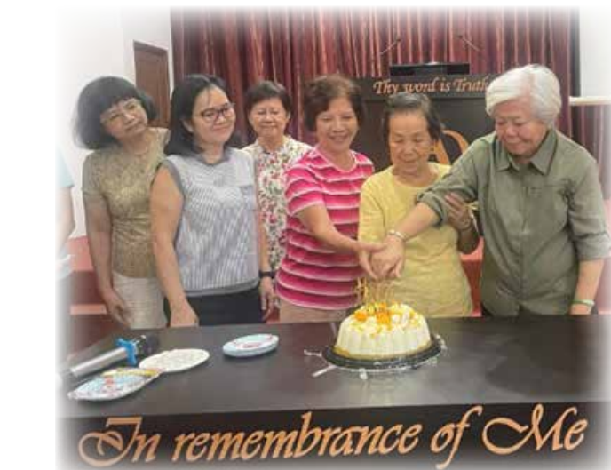
Celebrating Mother's Day with our Batam sisters