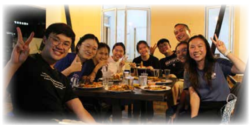
Missions Night dinner at Filadelfia Church