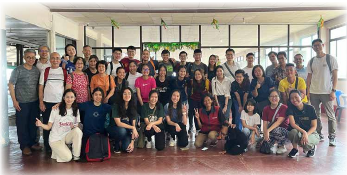
Combined Team Photo on Day 2

Though the team faced a few setbacks and unexpected situations, God was always in control and the team could see and testify of God's sovereign hand working throughout the trip, allowing them to minister to everyone He had placed in the team's path. The team saw about 34 eye, 86 medical and 80 dental patients in total during the trip. The team was blessed with experiencing God's power working through them when sharing the gospel and catering to both physical and spiritual needs of the people in Batam. The two non-Christian dental students who joined the trip attended the Exploring Christianity course afterwards, a testament of God's love and grace that they experienced first-hand during the trip. While the trip has ended, there is still much to be done for the Lord's harvest. It is still plenteous, yet the labourers are few (Matt 9:37-38). There are still many lives that are yet to be touched by the Gospel. Our prayers are for the continued support of both spiritual and physical needs of the Batam people, and the growth of the churches there.