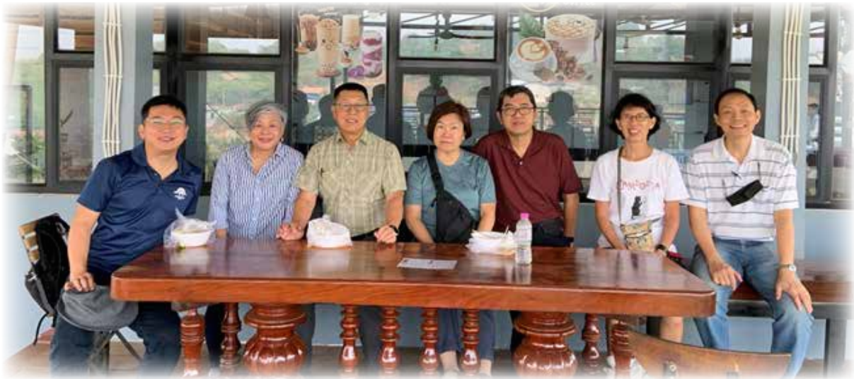
The mission team at the meeting venue in Ban Lung

The youth seminar was held over two days on Friday and Saturday. Our aim was to share God's word simply with the youths and exhort them to obey God's moral law in the Ten Commandments and to walk close to the Lord.