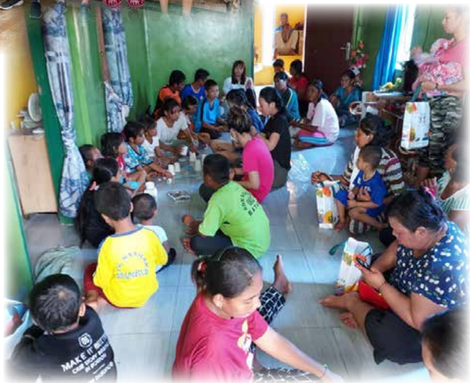
Children and adults alike, all participating in the activities and crafts we had planned.

After grouping back from their respective venues, the team enjoyed a sumptuous lunch with a wide array of fresh seafood. The team was also blessed with a magnificent view of the great blue sea from the restaurant, reminding us of God's eternal power and character revealed through His creation. After lunch, some of the team members took a tour around the Filadelfia elementary school and orphanage compound, which were just beside each other. A new building had been erected in the school compound that had been under construction during the mission team's last visit in 2022. It was truly amazing to see how God had blessed Elder Ady's efforts to complete the expansion project and increase capacity for the growing student population, through the help of his team and generous offerings received.