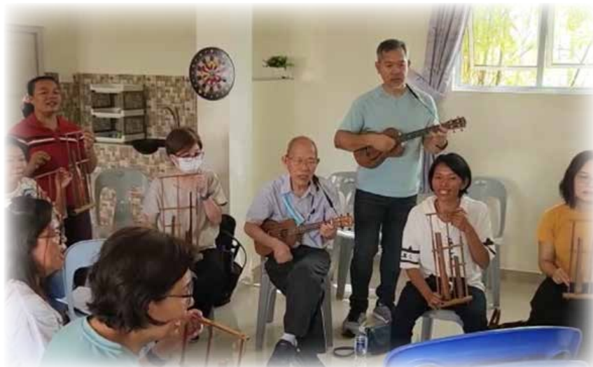
Music making with Angklung & ukulele