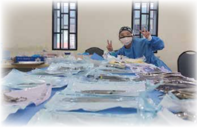
Ready to begin dental clinics at Batu Aji!