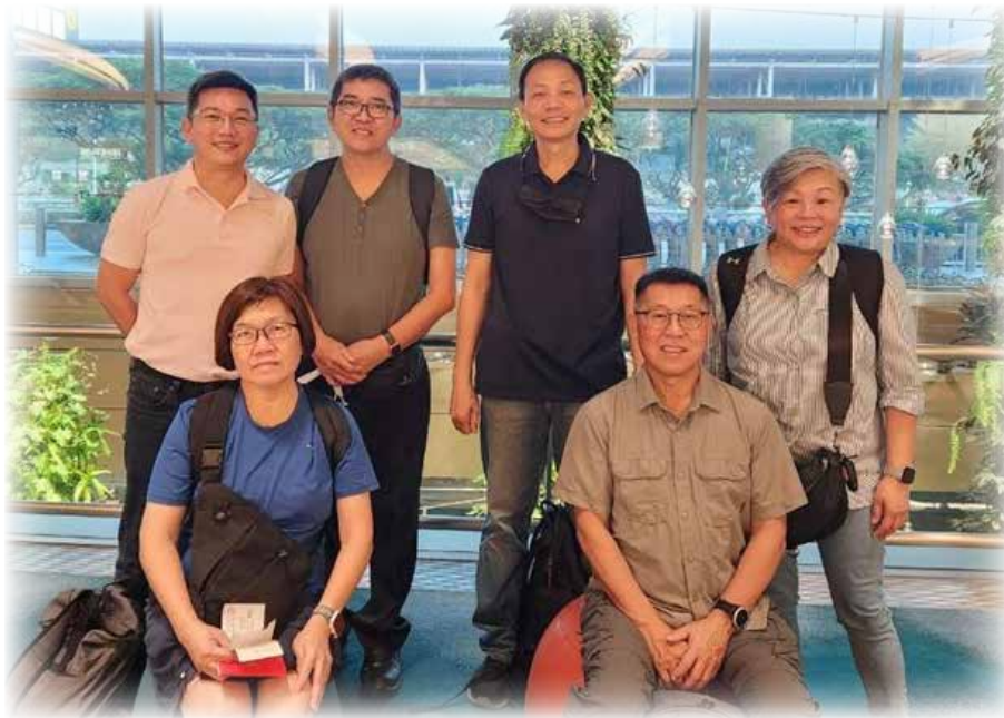
The mission team at Changi Airport

And how shall they preach, except they be sent? As it is written, How beautiful are the feet of them that preach the gospel of peace, and bring glad tidings of good things! Romans 10:15