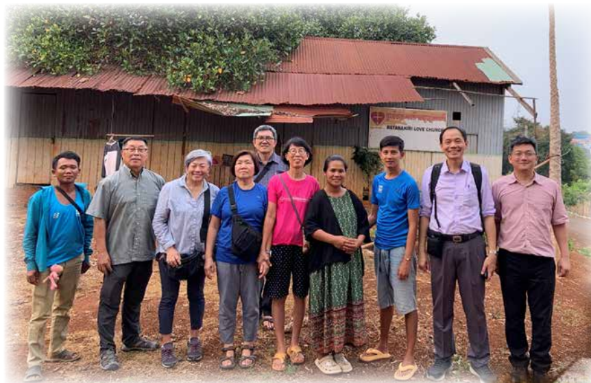
Mission team visited Ratanakiri Love Church and taught Sunday School