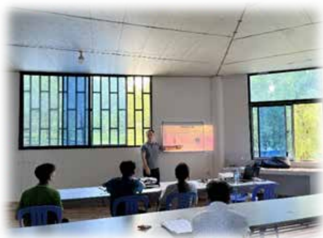
Basic Korean Class

Our Lord Jesus exhorted His disciples to pray to overcome the circumstances of these situation.