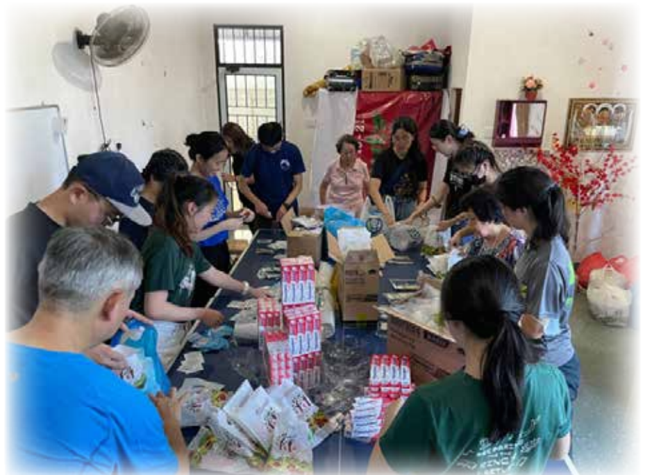
Packing goodie bags at Filadelfia Church

To inculcate in Lifers the desire to develop missions awareness and a passion for winning lost souls for Christ (Romans 10:11-15)