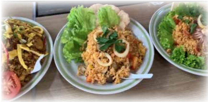
Our Singapore team's yummy fried rice