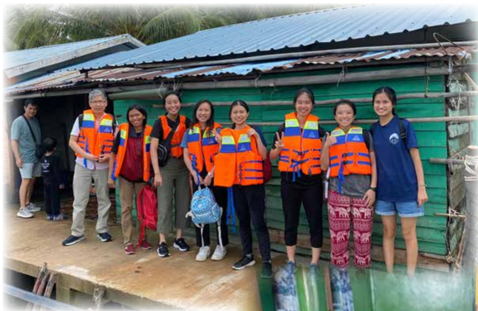
Arrived safely at Todak Island!

pleasantly surprised that the older children and even some adults were excited to join in the singing, crafts and gospel bracelet making. Truly, the gospel is applicable for all age groups, and is powerful to change the hearts of all those who hear.