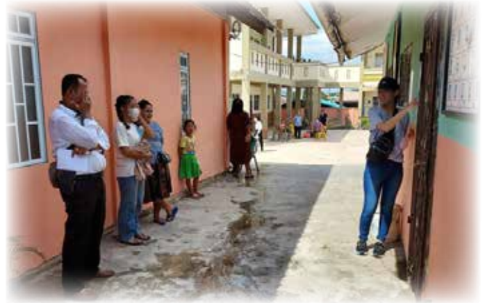
Conducting eyesight tests

Concurrently, the other team headed to Filadelfia Orphanage for a time of fellowship with the children there. The team also brought the orphans to a nearby mall for a time of buying gifts for them. Much to the team's surprise, the orphans also offered to buy them gifts, and the team left the orphanage with their hands full of gifts and their hearts filled with love. While the team went to Batam to minister and give love, they also received much love in return. Indeed, God's love was manifest throughout the trip. Both teams then met back at the ferry terminal and headed back home to Singapore.