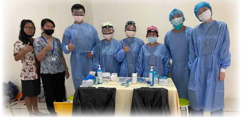
Dental outreach at Efata