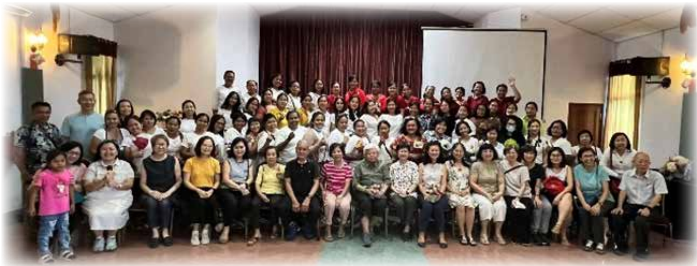
One in Christ!!

The purpose of our trip is to build rapport with our Batam sisters from five churches namely Sagulung Baru, Tanjung Piayu, Batu Aji, Petra and Filadelfia. We are reminded by what Paul said in Acts 17:26 "And (God) hath made of one blood all nations of men for to dwell on all the face of the earth, and hath determined the times appointed, and the bounds of their habitation." Truly there is no difference in God's sight of whatever race we are, in Christ, we are all one. We hope through our interaction, we could all show and experience the love we ought to have one for another as disciples of Christ.