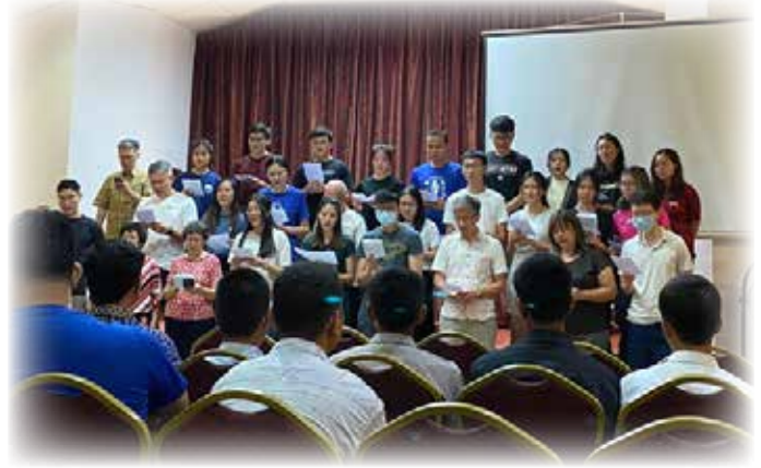
The team presenting the song items at Missions Night.