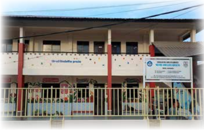
The newly-built wing of the school compound, adorned with beautifully painted murals.