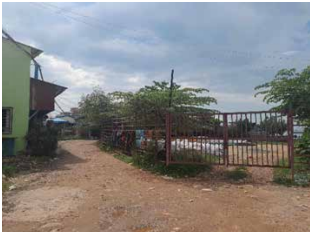
Entrance to the port village