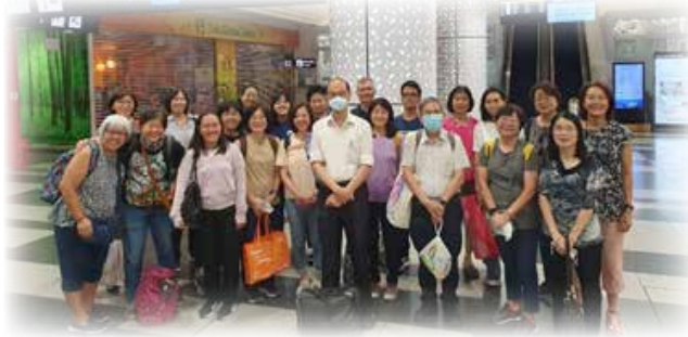
The team at departure at HarbourFront

With this promise and much prayer, a group of 22 set off on 6 August to conduct Sunday School classes at two churches in Batam, as well as to present a song item during the worship service at GAPPI Batu Aji.