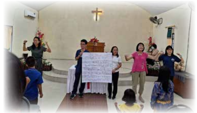
Memory Verse at Batu Aji

I give thanks to the Lord for the wonderful experience I have on the Batam mission trip. Thankful for His protection during the journey and His guidance in all that the team had done as well as the warm fellowship among the church brethren. The children at Batu Aji Church we administered to were eager to learn, evident in them picking up fast both the songs and memory verse taught as though there was no language barrier. Pray that the children will continue to experience the Lord's goodness and to know how great our God is just as I have throughout the years.