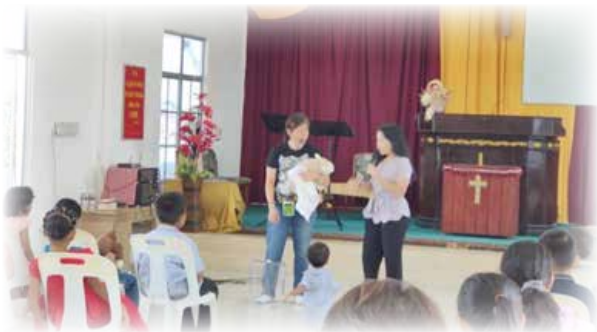
Story Telling at Sagulung Bahru

It was my first missionary trip and I did not know what to expect so I prayed and indeed, God has been preparing me for the mission trip. With weeks of preparation for the song items, I am more confident in singing with the fellow sisters to present the song item to the brothers and sisters in Batu Aji.