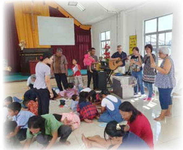
Craft work at Sagulung Bahru