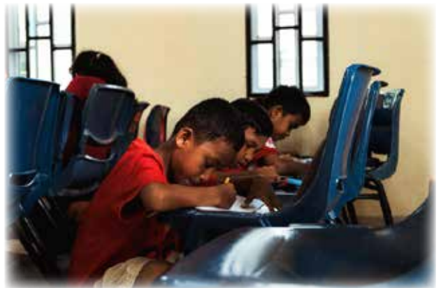
Doing simple crafts to drive home the lessons learnt

This was followed by crafts. It is the team’s prayer that the spiritual lessons of faith would remain in their hearts and help them grow spiritually too.