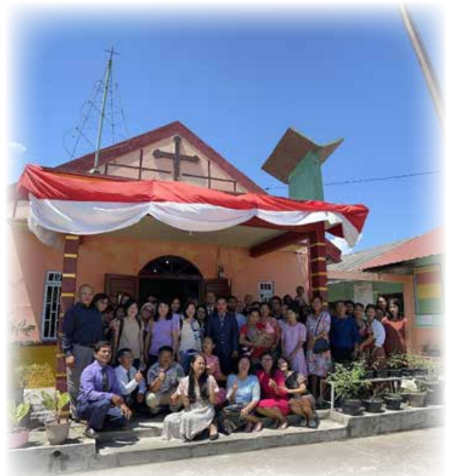
The team with church members at Batu Aji

While the trip was organized by the Ladies' Sunday School, everyone was welcome to participate. We had husbands and children as well as other church members serving together with us in this ministry. We seek the Lord's provision and guidance for future trips and ask you to pray with us and join us in ministering to the children in Batam.