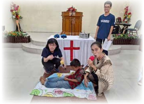
Story Telling at Batu Aji