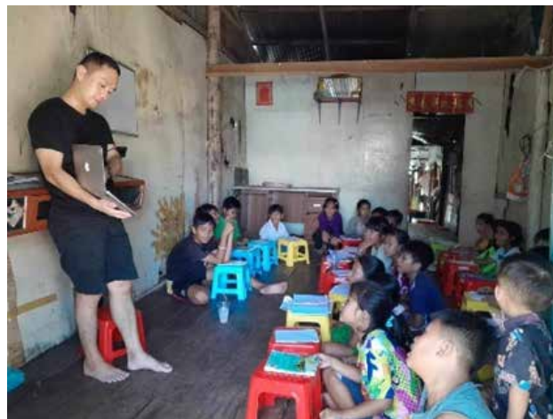
Class with whiteboard and chairs

The second challenge we face in ministry is the education and religious background of children. Although most children in the village attend free school, they are still learning to read and write, and the pronunciation and intonation of the