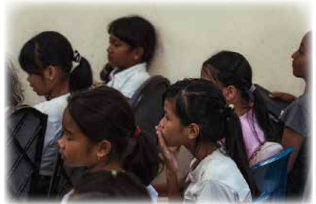
Listening attentively to the story

Craft time followed, where each child was given a Wordless Book bracelet with a little leaflet explaining what the colours stood for. A simple arrangement of black, red, white, green, and yellow beads carried the deep, rich Gospel message of salvation and hope. It is our prayer that the bracelets would be an effective tool to make this message easy to remember so that it would remain in the children's minds and thus sow the seeds of the Gospel. Perhaps it would even be used to evangelise to their family members as well. Like the previous day, this was followed by lunch and a session of games before closing the programme for the day.