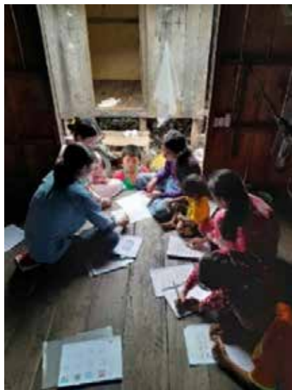
Second visit in July

One of the challenges of Port Village Ministry is providing children with a place to share the gospel and learn the language. We have changed locations four times since we started ministering in the village. As the number of students increased, we began considering renting empty houses to provide sufficient space for children. In particular, since a new tenant moved into the house we previously used on Sundays, we started holding classes outdoors. Recently the landlord of the new house agreed to rent it to us for US$2.50 per week. We pray that we can find a stable place where we can have blessed time of fellowship with the children each week without worrying about new tenants.