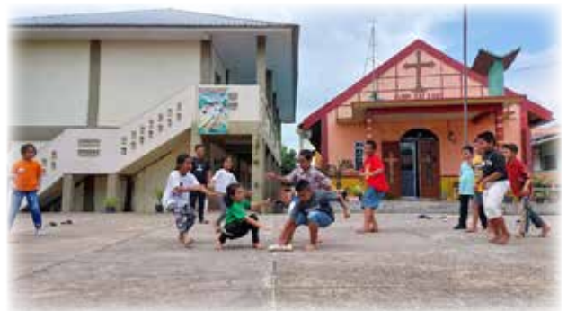
A fast-paced round of "Dog and Bone"

The team then went to visit Barelang bridge where the high vantage point provided a great view of God's breathtaking creation of the land, sea and sky. We ended the day with a kelong dinner before heading back to reflect and rest.