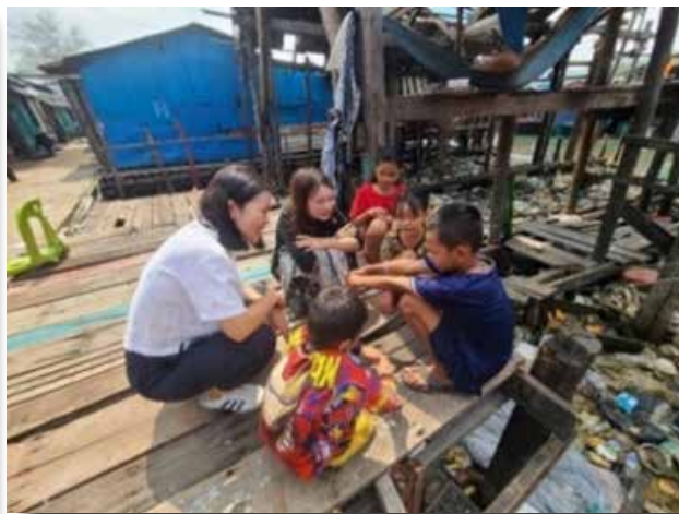
First visit in April

We shared our burden we felt toward that port village and visited them again on 24 July. With the help of a woman, we found a house in the village and were able to start English and Vietnamese classes with four children. Although we were not fluent in Khmer at the time, the children participated enthusiastically. However, on our third visit, the family of the Vietnamese children we initially met left for Vietnam again due to family circumstances, and only one Cambodian girl who had previously participated in the classes came to join. So, we went around the street and gathered the children. By God's grace, many children came to join the class the next week, and we were able to teach the students in a better environment by providing a whiteboard and 20 chairs with the prayer and support of Life B-P Church.