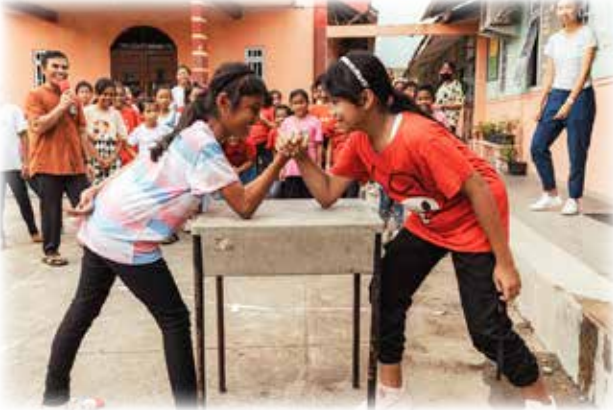
Arm-wrestling like how Jacob wrestled with God all night long