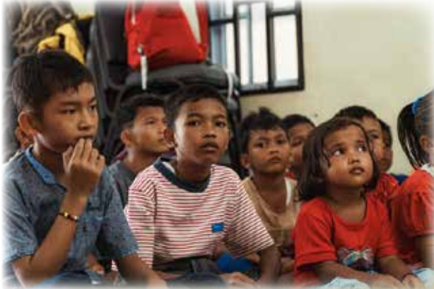
Group photo with all the staff and students

We hope they were able to grasp our poorly spoken words in Bahasa!