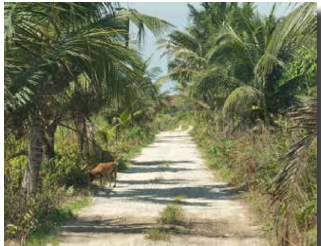
The unpaved road to Gappi Libo