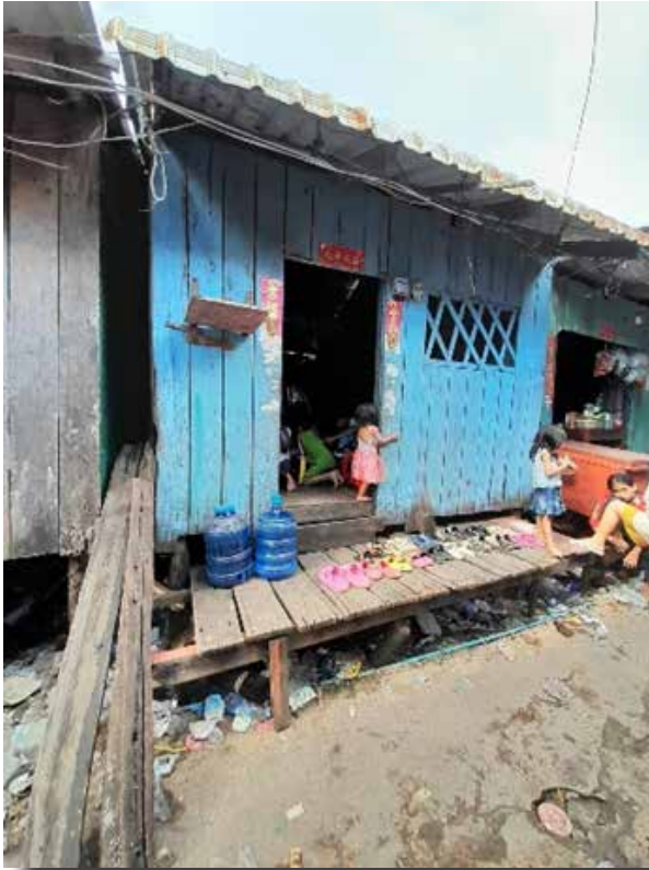
The house we are currently using

Khmer language there is slightly different. In terms of religious background, most children come from Buddhist families, so the Word of God is unfamiliar to them. When we tell Bible stories, we often find that children have difficulty understanding the content. We pray that challenges like these serve as an opportunity to rely on our God alone, to love children with compassion believing that the Lord may open their hearts in His time and will.