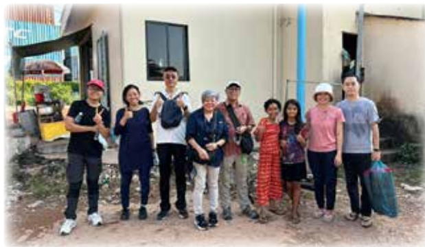
Group photo at the entrance to the Port Village with two of the students