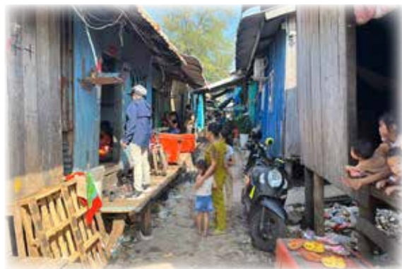
The narrow road that leads to the boat jetty.