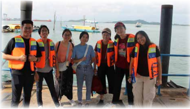
The Island Ministry Team with their life jackets before boarding the Pompong (Top)