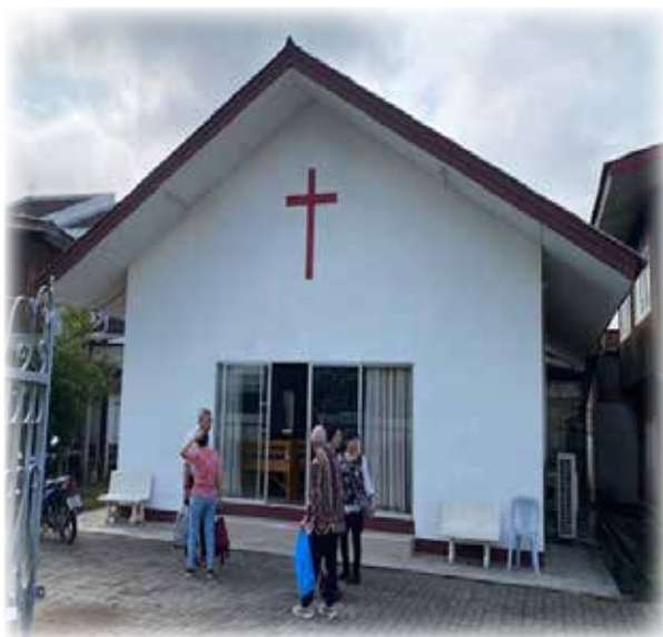
Eternal Life Church Chiang Mai