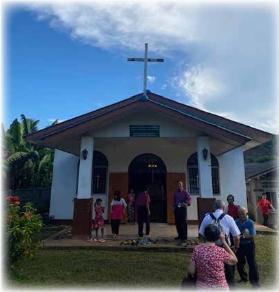
Eternal Life Church Hwikheelekmai

Nirand's good driving skills to navigate the windy mountain roads.