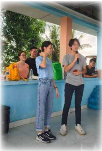
Impromptu dental talk to the villagers. (left)

who arrived on that day) and dental screening for the Primary 1 – 6 students in Batu Aji. As compared to the previous day, the number of students in Batu Aji doubled the number of students that were screened in Filadefia. By the grace of God, the team could still complete the dental screening and fluoride gel application for most students.