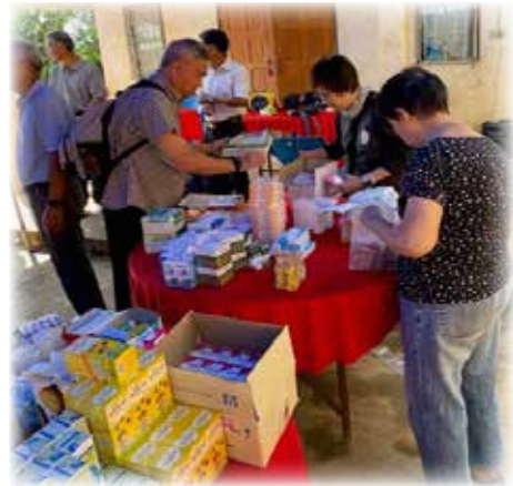
Preparing the dispensary