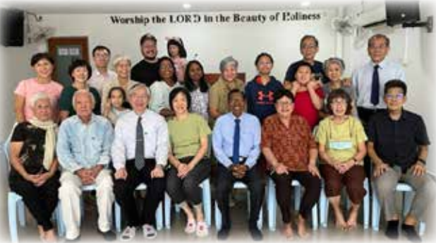
Group Photo – Evangel Malacca B-P Church