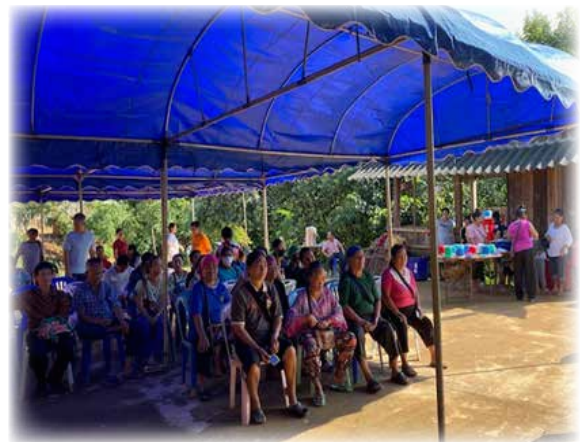
Villagers waiting for the clinic session

On 24 October, the medical mission was held at ELC Yanam which was about 30 mins drive from our resort. Some villagers were already seated waiting under a tentage set up when we arrived. At the same time, some other villagers were preparing and cooking food for lunch by the side of the tentage. We heard from Rev Nirand that the