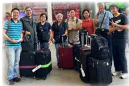
Safely arrived in Phnom Penh