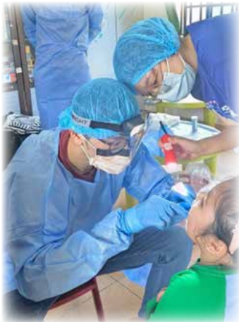
Dental Screening Ministry

For the first day, the team was focused on conducting the regular dental outreach consisting of three main aspects; (1) oral hygiene education, (2) dental screening and (3) preventive fluoride gel application. The Young Adult Lifers were also