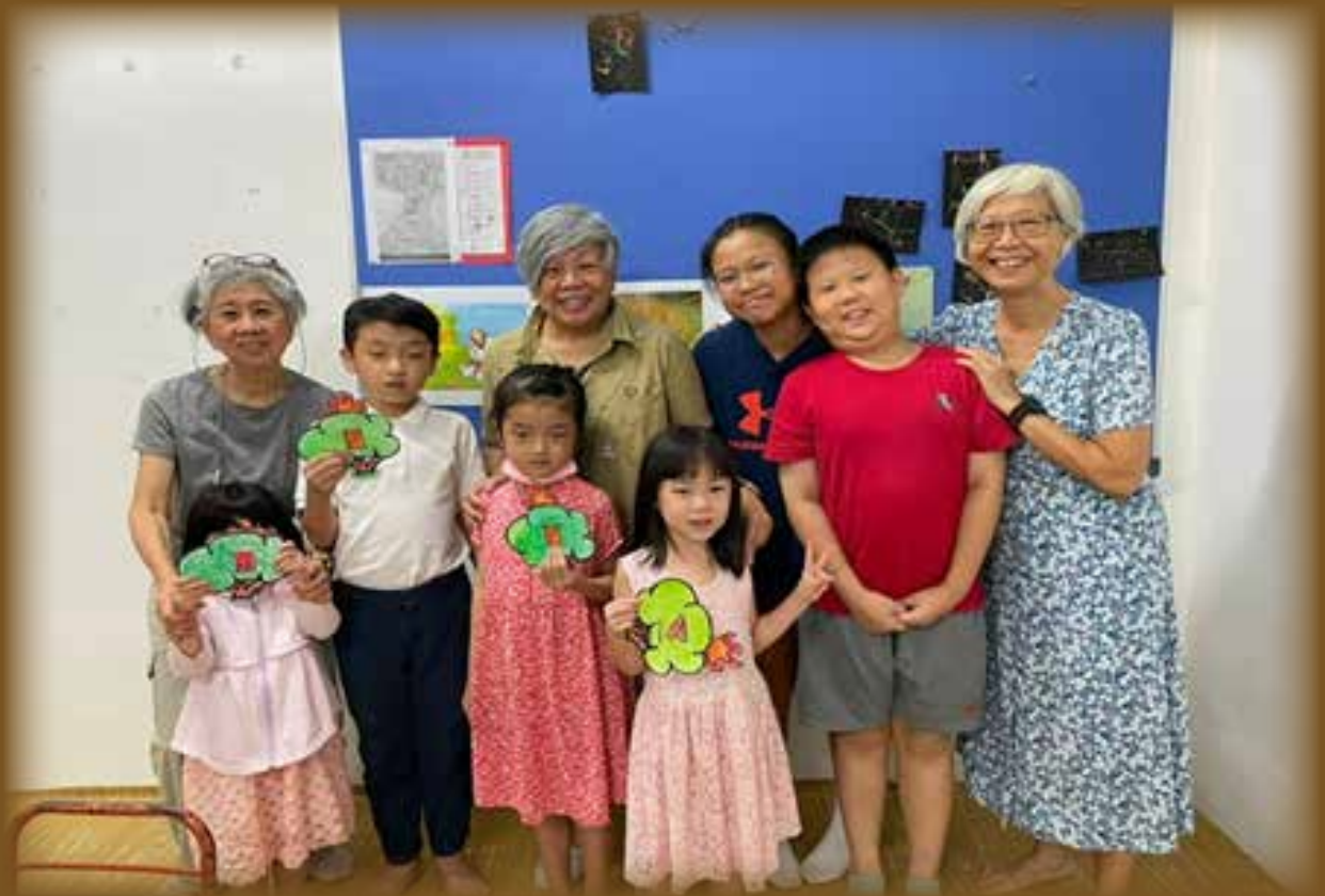
Visit to Evangel Tampak B-P Church

Say not ye, There are yet four months, and then cometh harvest? behold, I say unto you, Lift up your eyes, and look on the fields; for they are white already to harvest. And he that reapeth receiveth wages, and gathereth fruit unto life eternal: that both he that soweth and he that reapeth may rejoice together. (John 4:35-36)