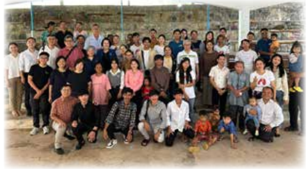
Group photo with Kampongsom B-P Church members