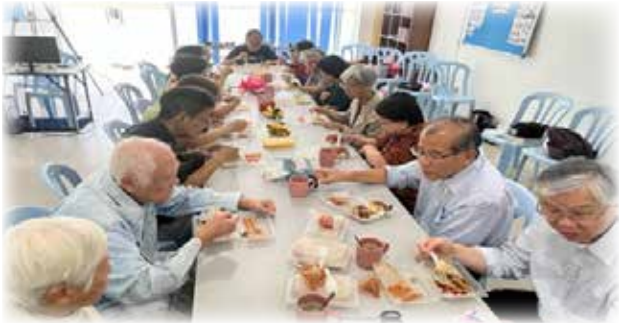
Fellowship lunch after Sunday Service at Malacca

After a fellowship lunch of packed chicken rice and home-grown fruits, the team departed for Tangkak. As we arrived early for the 5pm service, the team had a coffee-break at a local air-conditioned kopi-tiam. As the sky started to darken and rain was inevitable, we decided to rest and prepare early at Tangkak church.