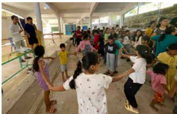
Children playing games at VBS