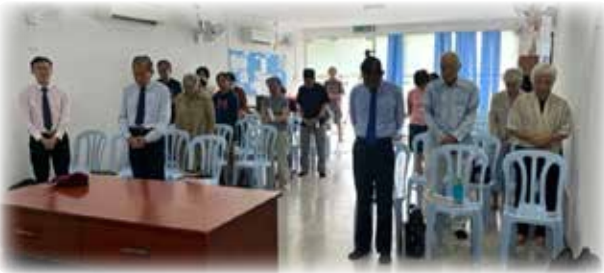
Congregation at Evangel Malacca B-P Church