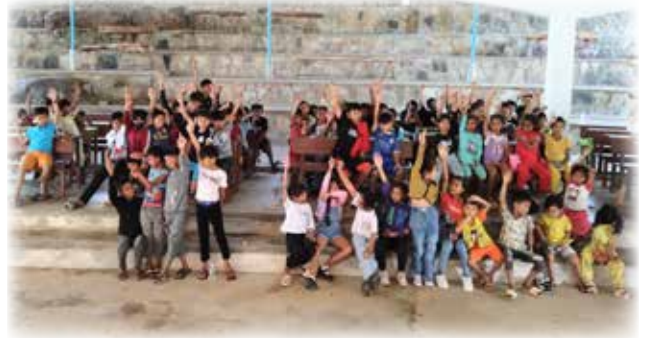
KCS students attending Saturday VBS responding to the gospel message

Although there was no school on Saturday, the KCS teachers specially invited the primary 3-6 students to come for VBS and thank God that around 77 children showed up, which was more than we had expected.