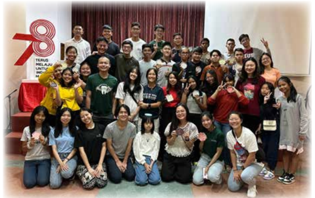
Group photo of the mission team mingling with Filadefia B-P Youth Fellowship and posing with their Jesmonite Coasters

In the evening, we organised a Jesmonite workshop with the Youth Fellowship at Filadefia B-P Church. The workshop involved using coloured Jesmonite shards to create a beautiful coaster, signifying how God through His wonderful grace, chooses to use imperfect people to achieve His perfect will for His glory. It was truly an impactful workshop where we enjoyed an intimate and fruitful time sharing about our brokenness and weaknesses with the youths. Some of the youths from the Filadelfia B-P Church were even moved to tears. It truly was amazing to see how despite our different languages, upbringing and socio-economic backgrounds, we share the common struggle with sin and our mortal flesh, and desired towards the same goal of battling sin and pursuing after holiness.