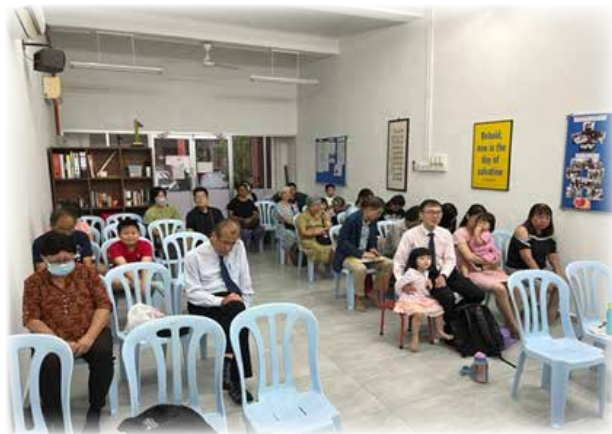
Worshippers at Evangel Tangkak B-P Church