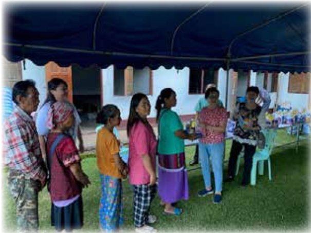
Presenting gifts to villagers