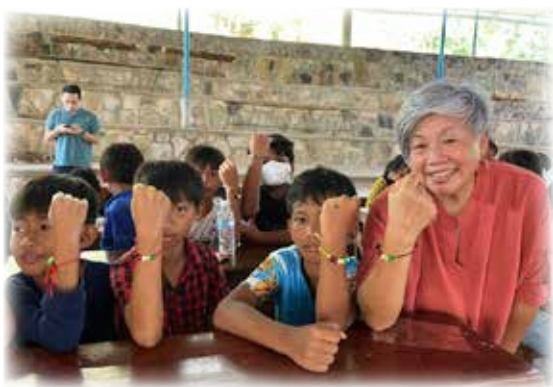
The students learned how to make gospel bracelets