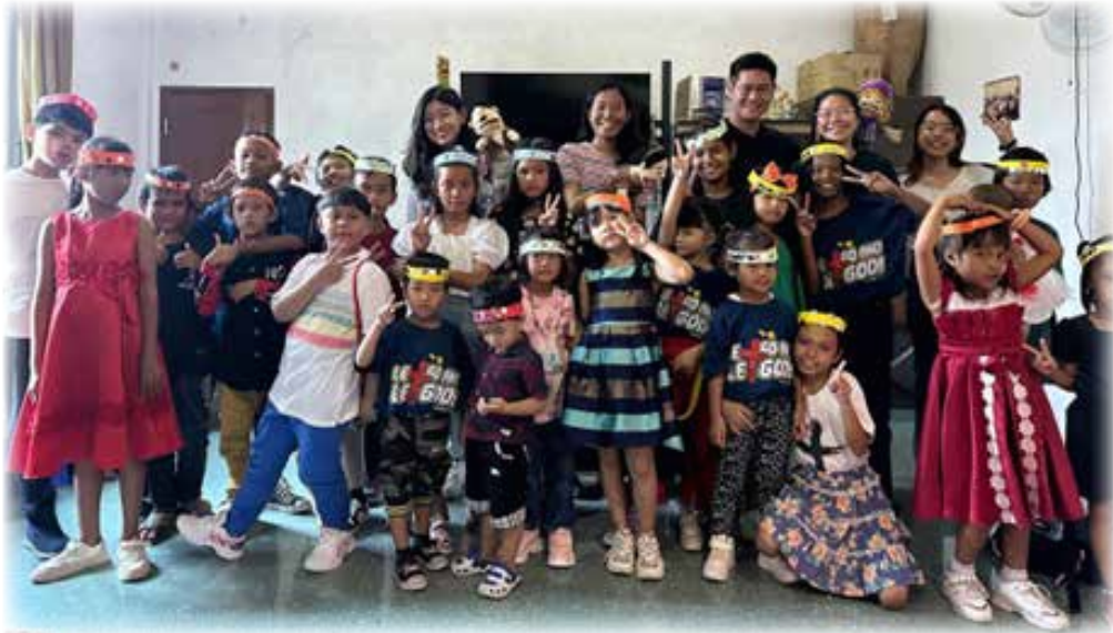
Group photo of children with their complete bible crafts after Sunday School.

On the final day, the dental team attended the Sunday worship service at Filadelfia B-P Church while conducting the children's Sunday school simultaneously. We were very touched by the children as they were able to answer questions about God's love and Jesus dying for them. Many of them also declared their love for God enthusiastically. We ended the session with playing with balloons with the children.