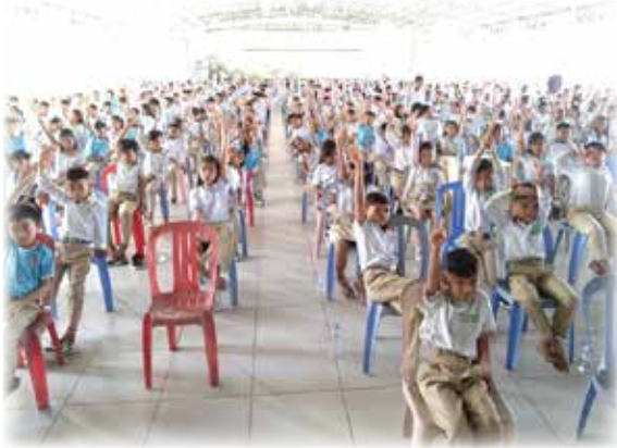
Primary School Students at Life School responding to the gospel message