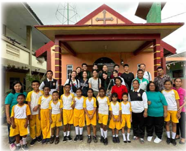
Group picture taken with the team and teachers of Batu Aji School

who arrived on that day) and dental screening for the Primary 1 – 6 students in Batu Aji. As compared to the previous day, the number of students in Batu Aji doubled the number of students that were screened in Filadefia. By the grace of God, the team could still complete the dental screening and fluoride gel application for most students.