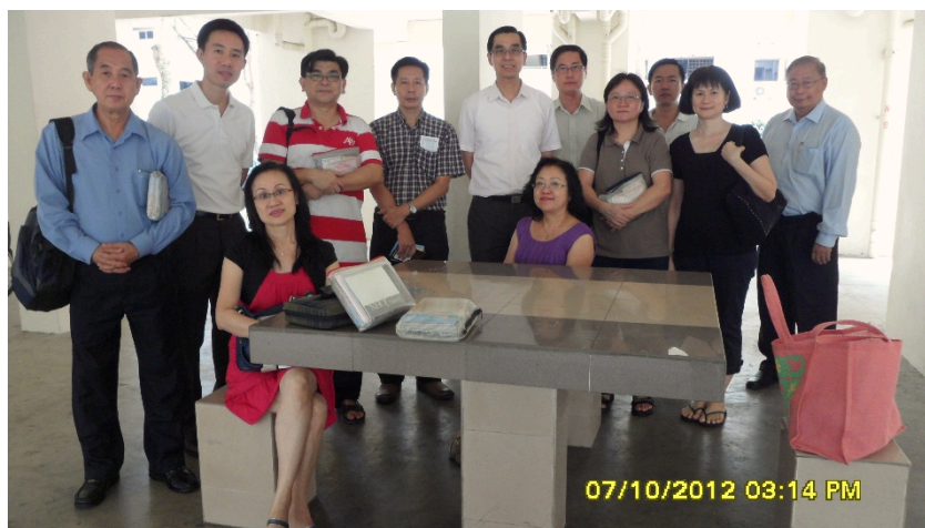
Blk 140 Yishun Ring Rd