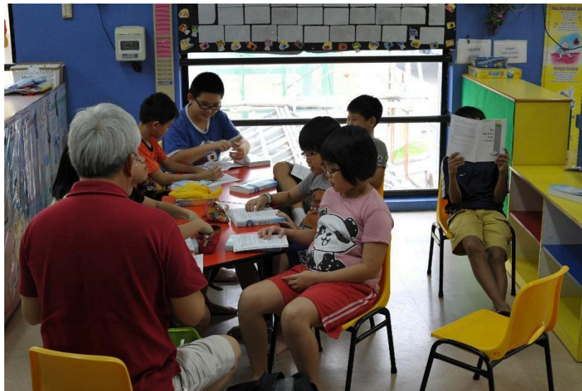
LCC @ Yishun