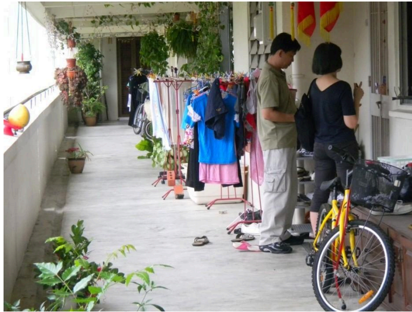
Blk 770 Yishun St 72